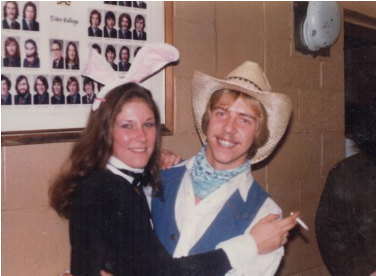
Getting his own little bunny makes this youngster smile big