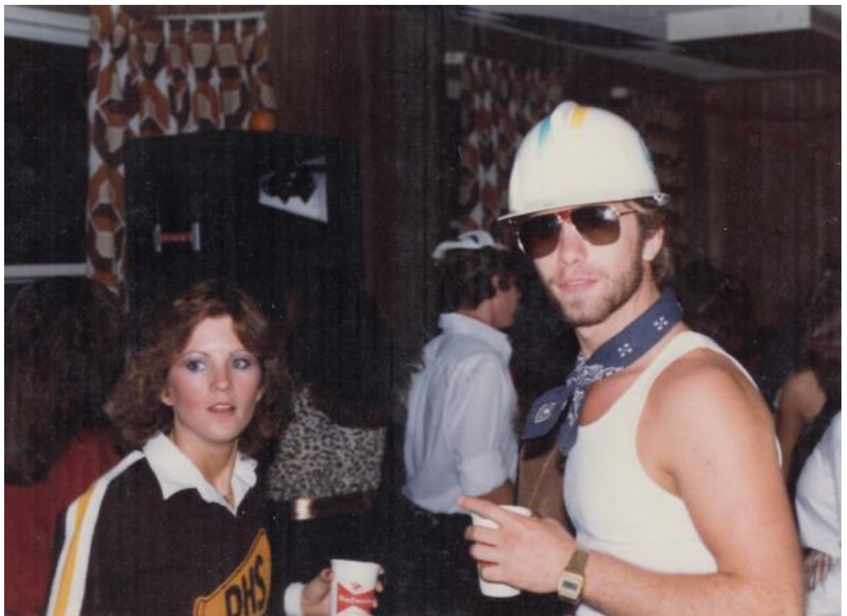
Not everyone's costume fits their personality