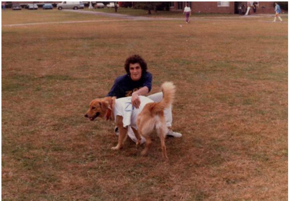
Spike and Michelob pose for a shot