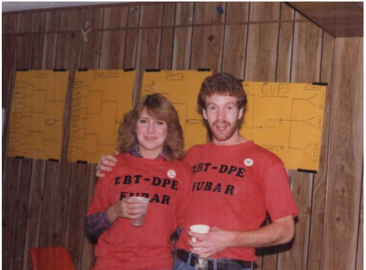
Too bad their performance wasn't as good as the effort they put into it!