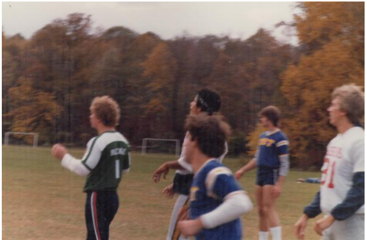
Everyone's checking out the Theta Chi and Sigger game – hoping for some injuries