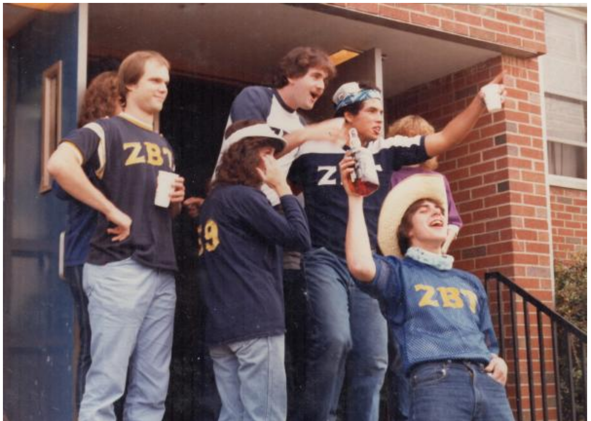
When Michelob makes another Frisbee catch – there are quite a few different reactions