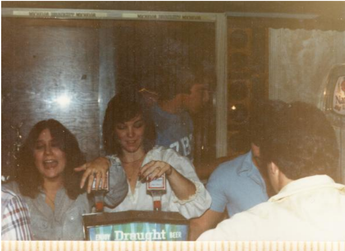
Female bartenders – that works