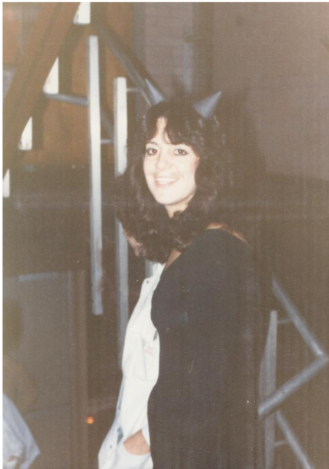
Our sweetheart is cute as a kitten