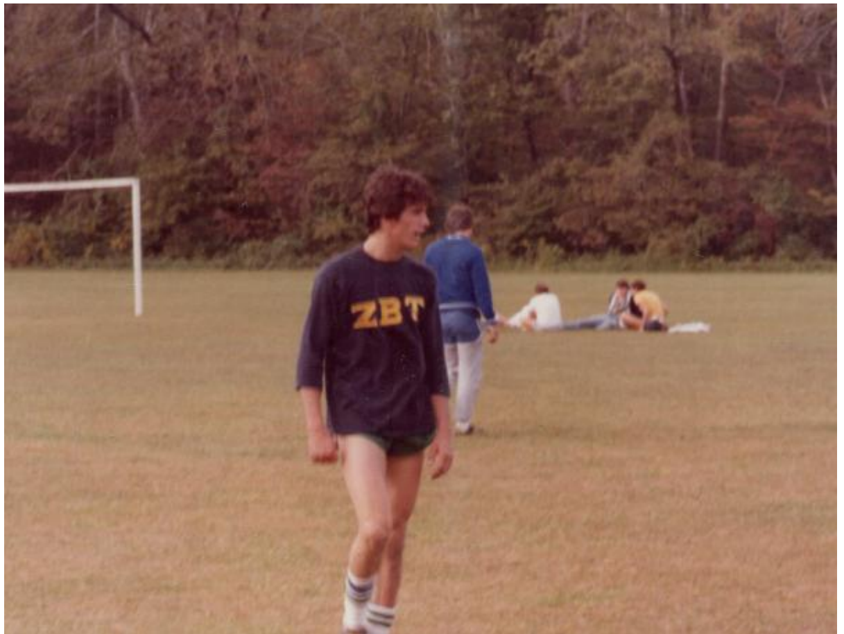
Nice legs Buck!