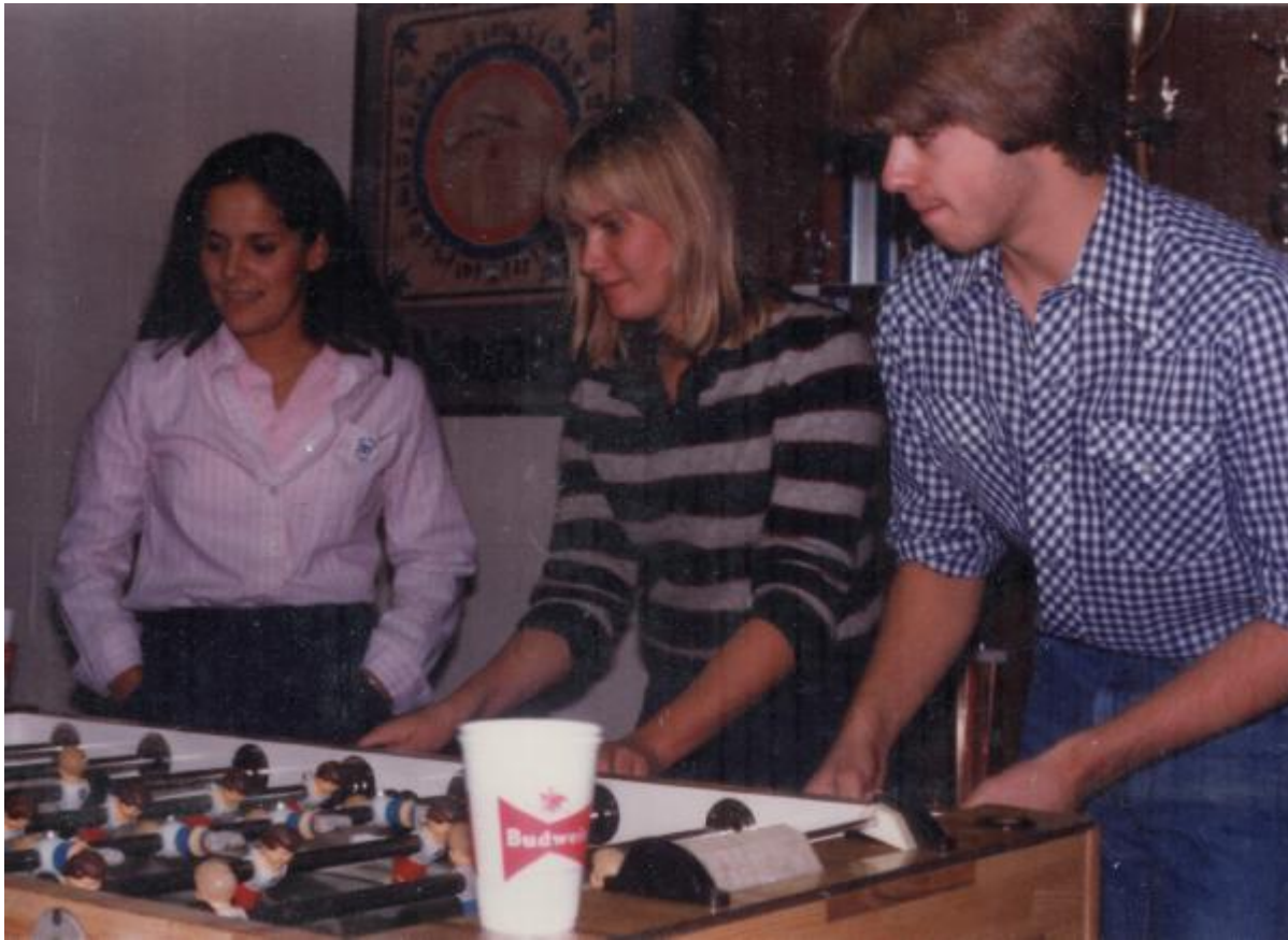
Lips forced to play defense for a change