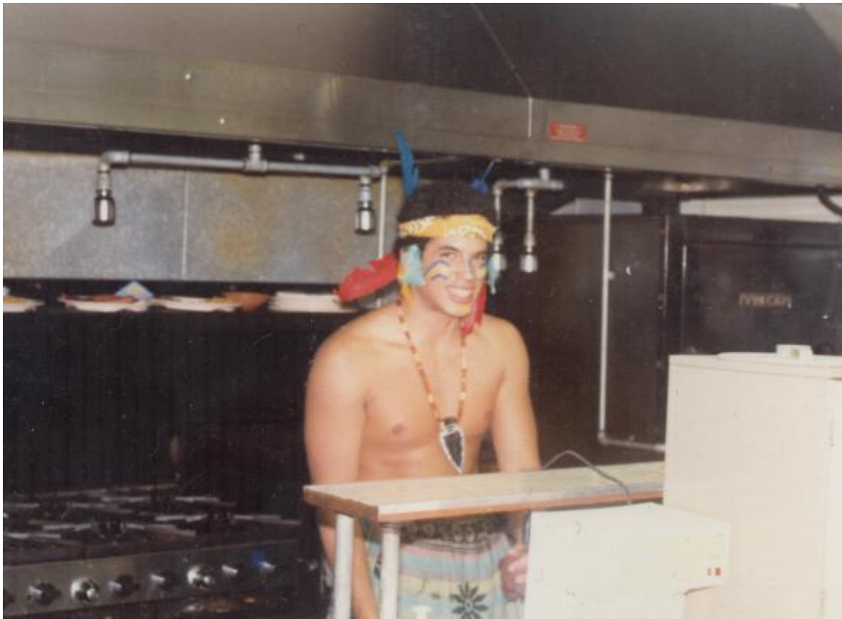
The Indian is recreating Thanksgiving all by himself