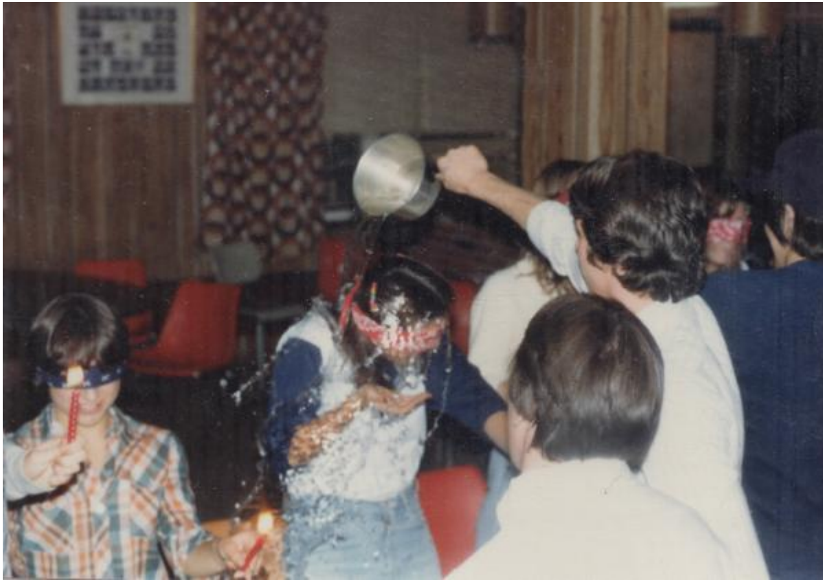
Buck found a new way to put the candles out