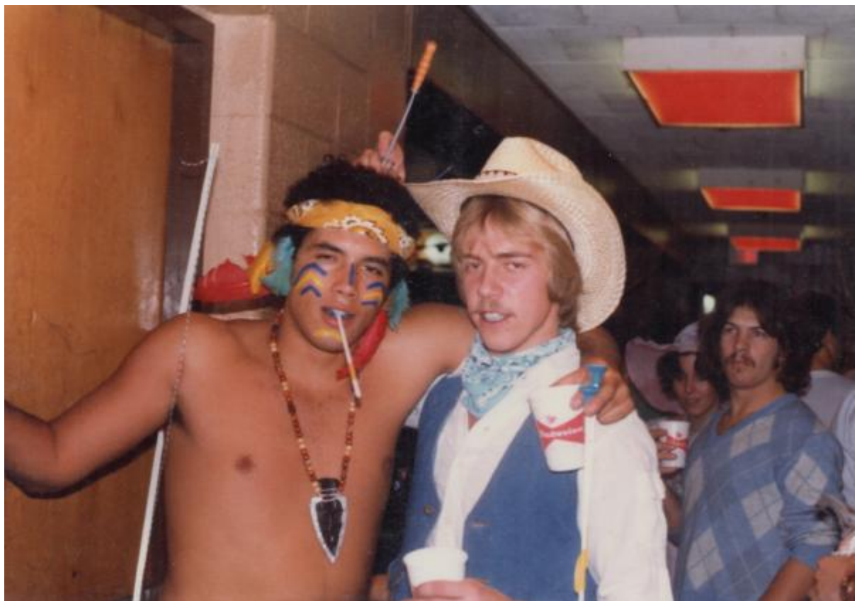
These two have a new way to play Cowboys and Indians