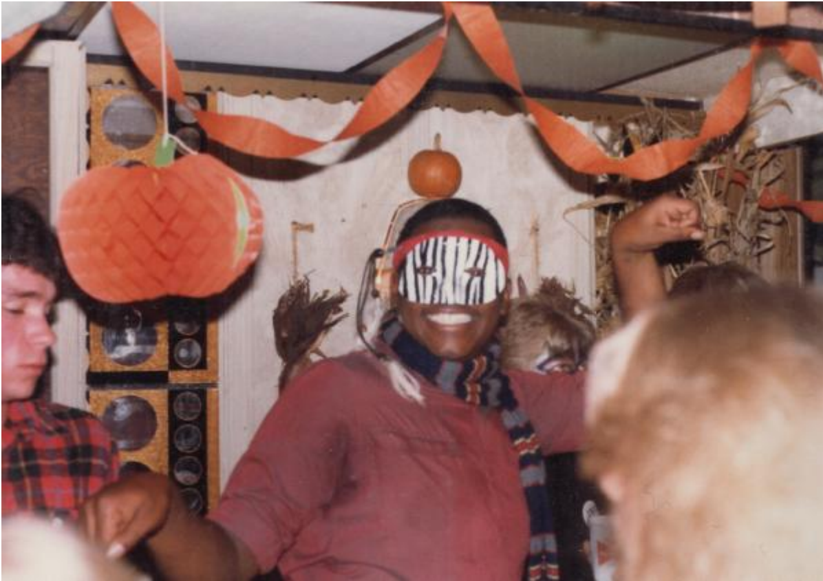
Roofus balances a pumpkin on his head