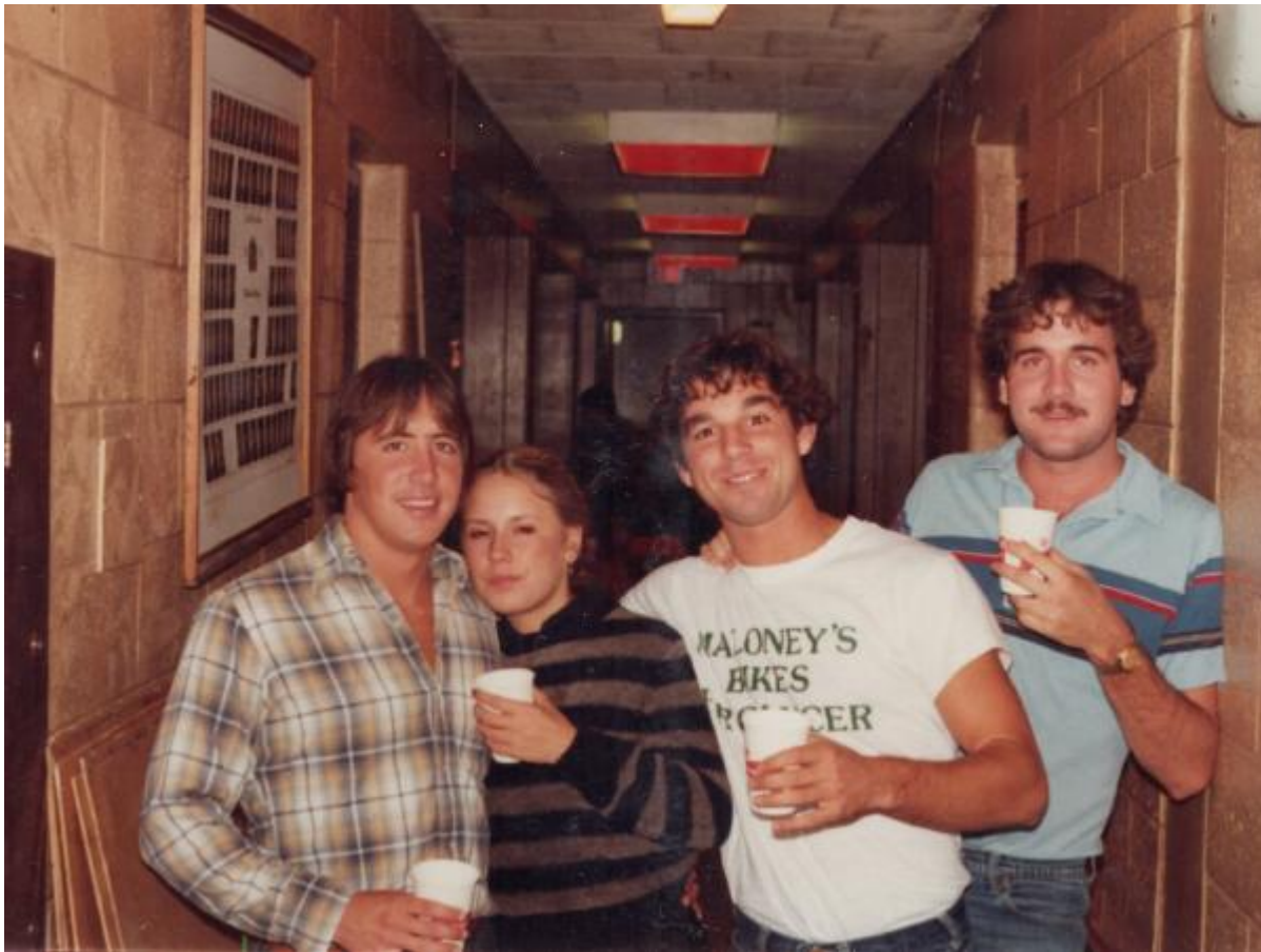
A few members of the best family in the house