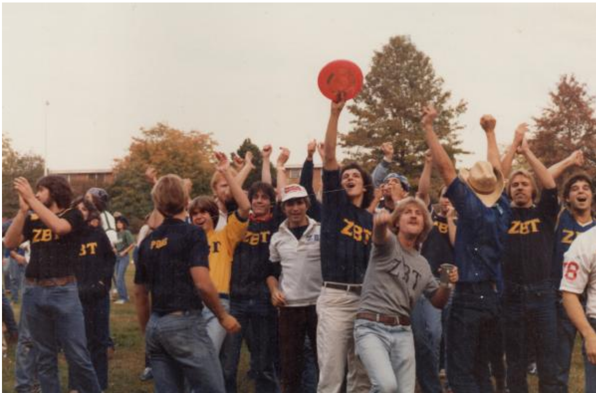
The brothers all get together to air out their armpits