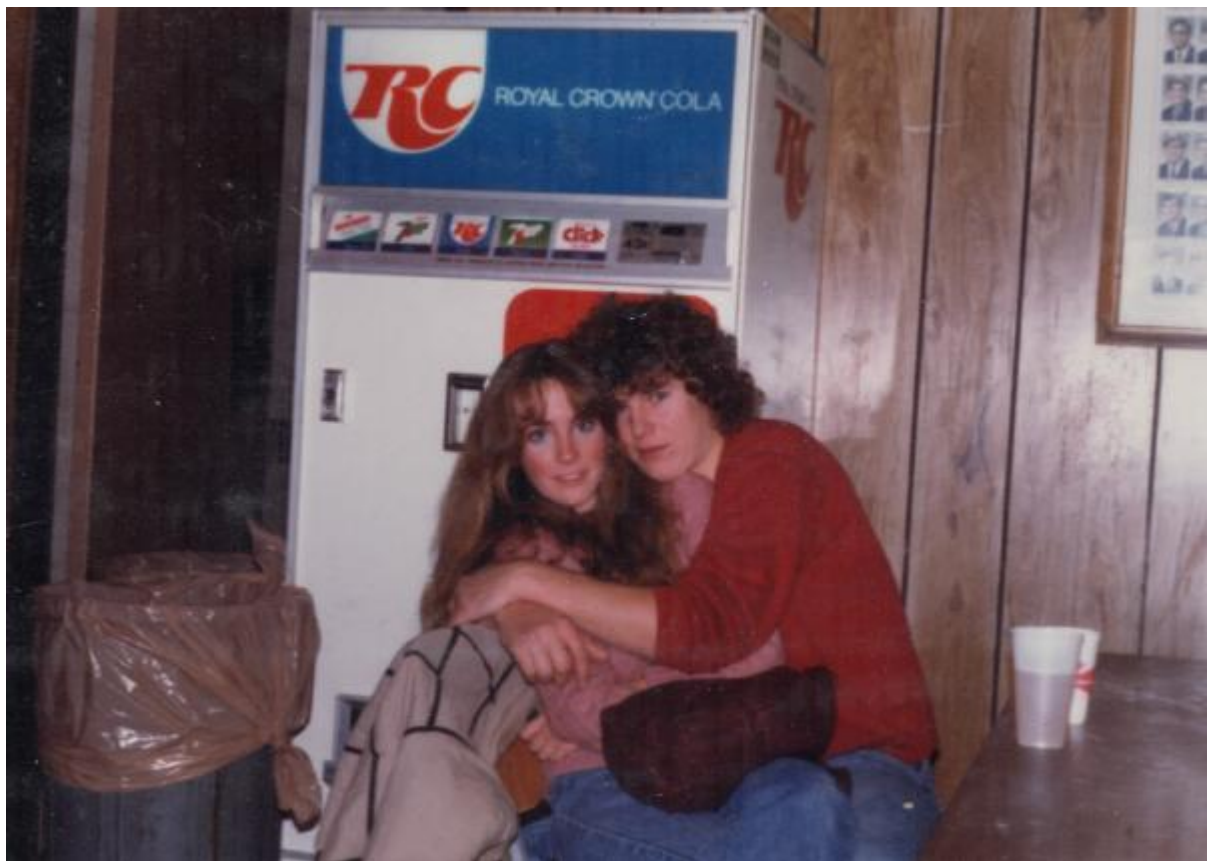
There must have been only one seat left