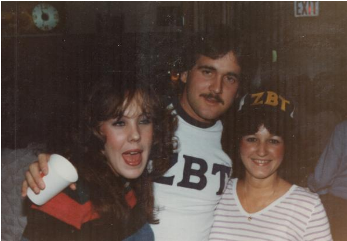
Only 11:30 and look at these three!