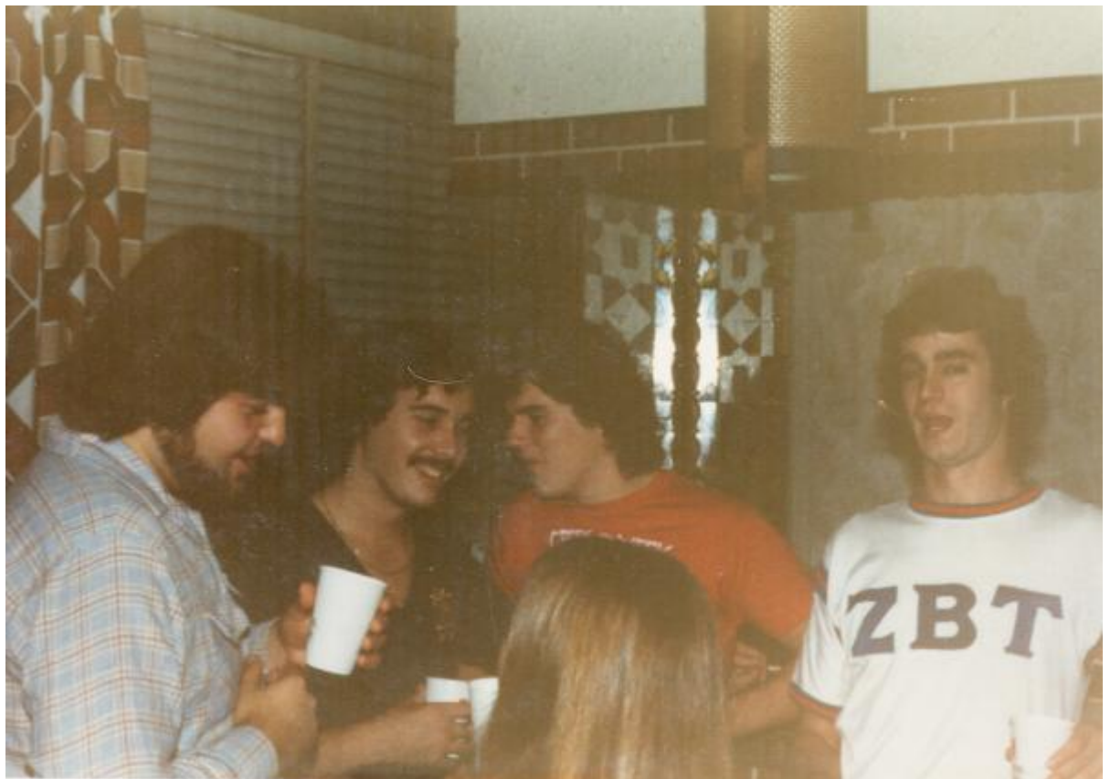
The old timers crowd around the bar