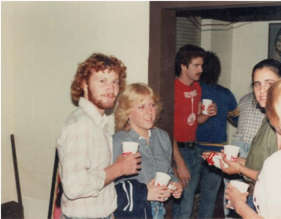
Rickster's actually taller than someone