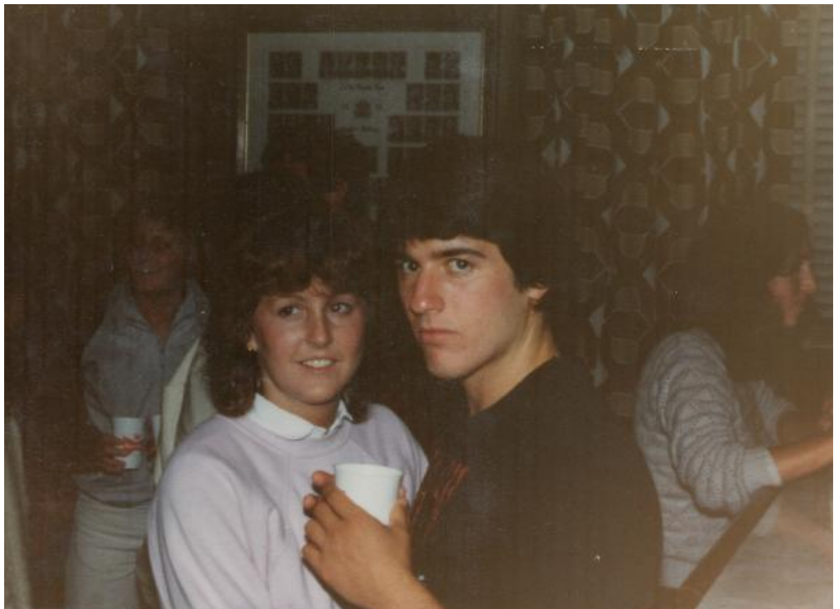
Mr. and Mrs. Coach