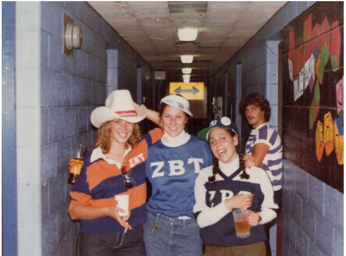
The little sisters are always happy to help drink our beer