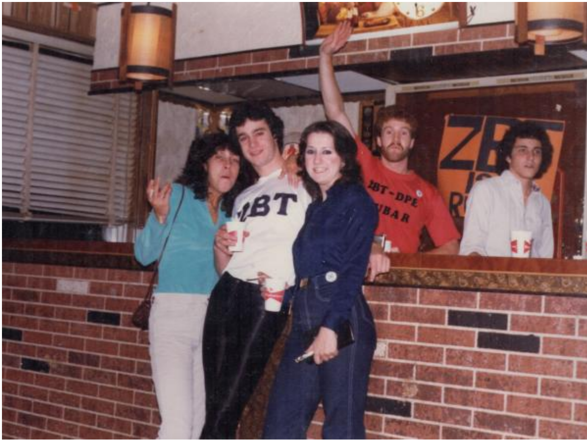
Oz looks sexier than the girls with those pants