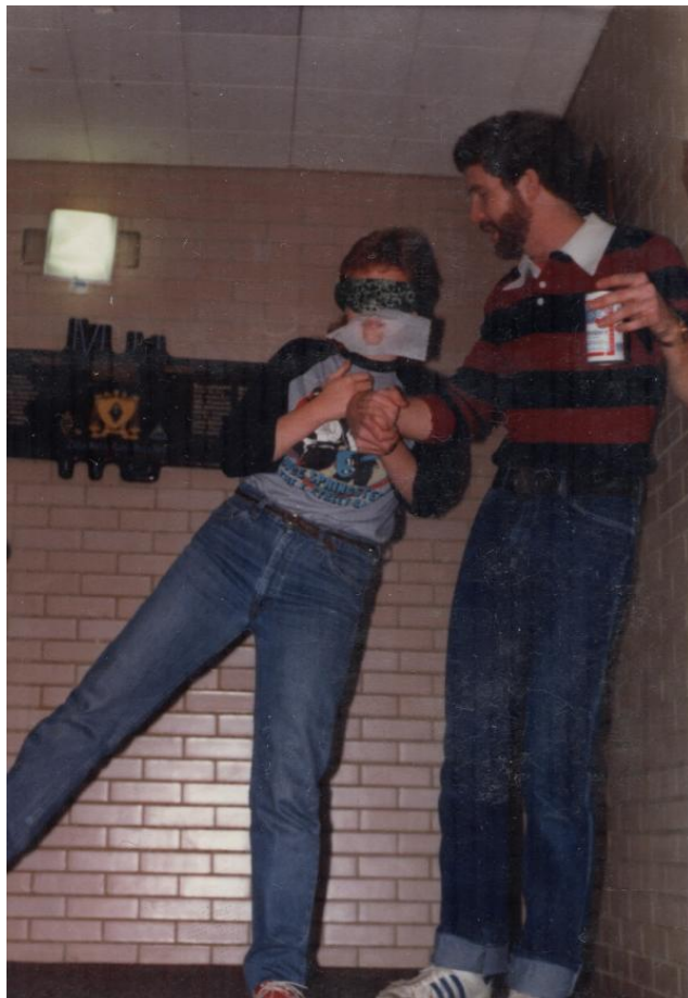
Timco has the beer – but who's stumbling?