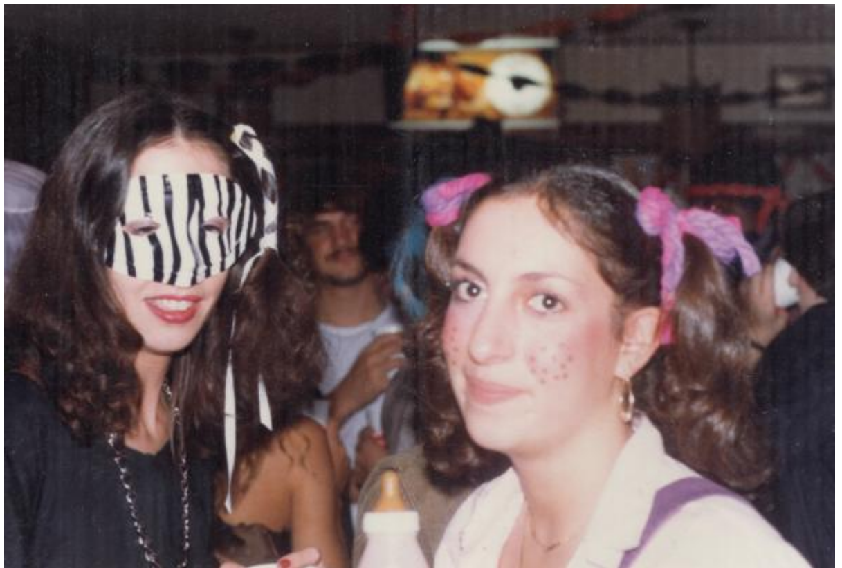
Who likes to start fires?