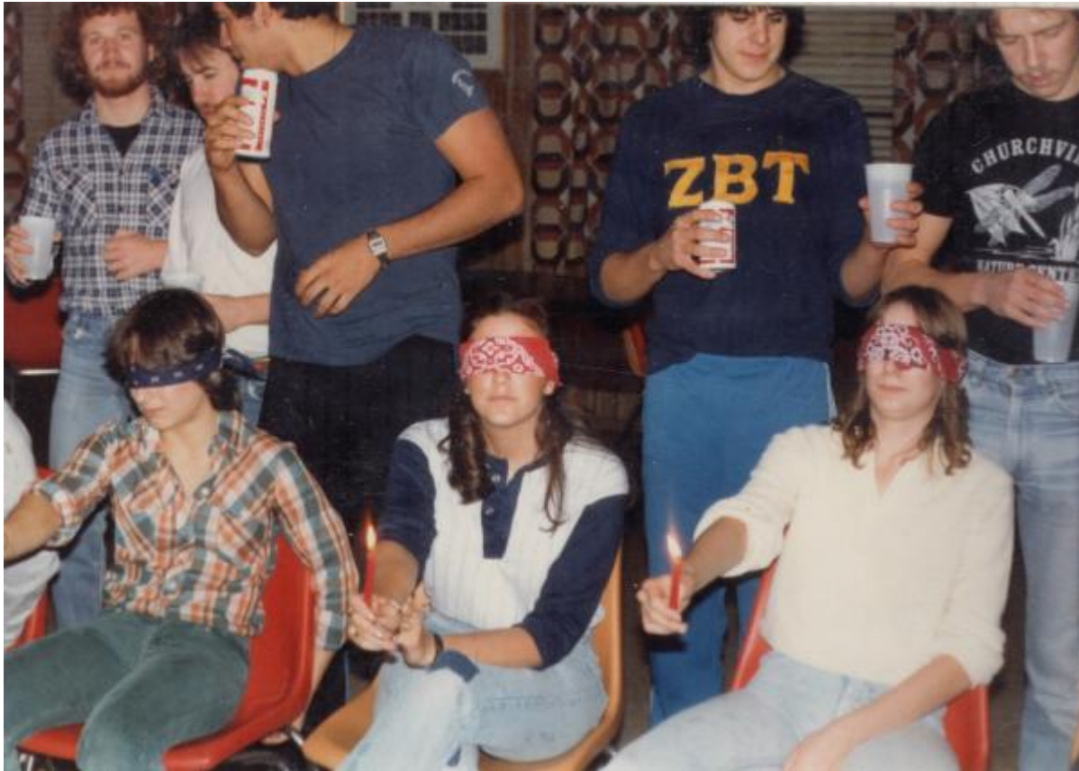
JoJo can't wait to dump that cup