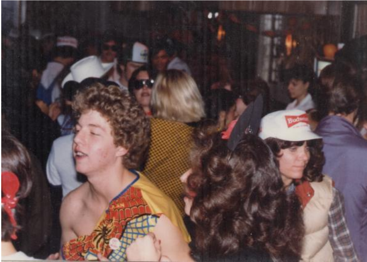
Spiderman slowly loses his costume and becomes mild mannered SteveBob