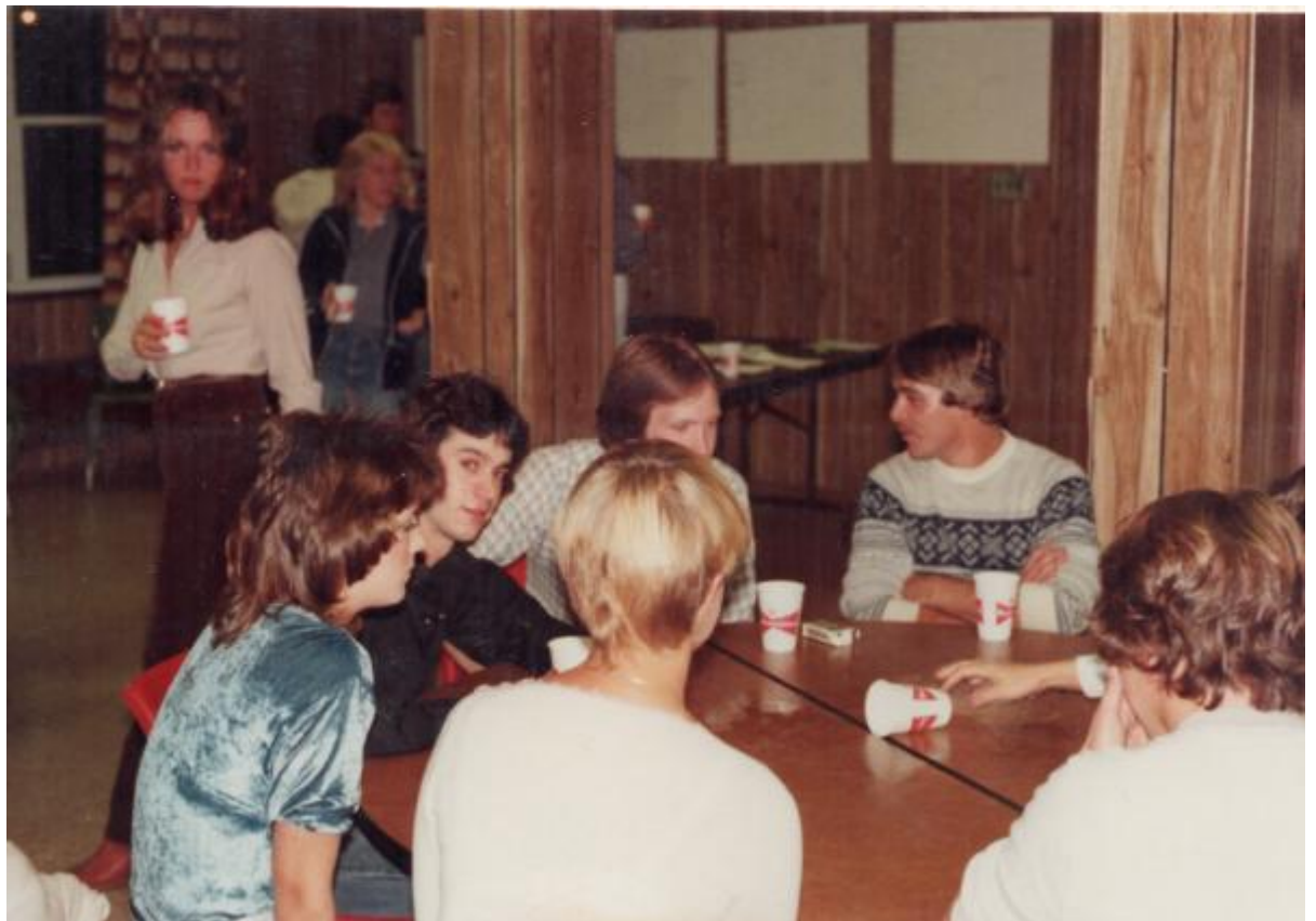
Some veterans of the game in action