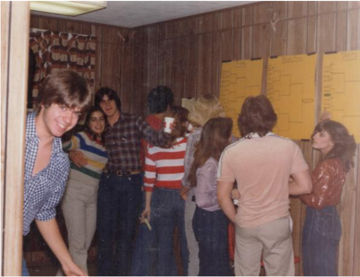
They're trying to figure out who's luckier – those still in the FUBAR contest or those already out