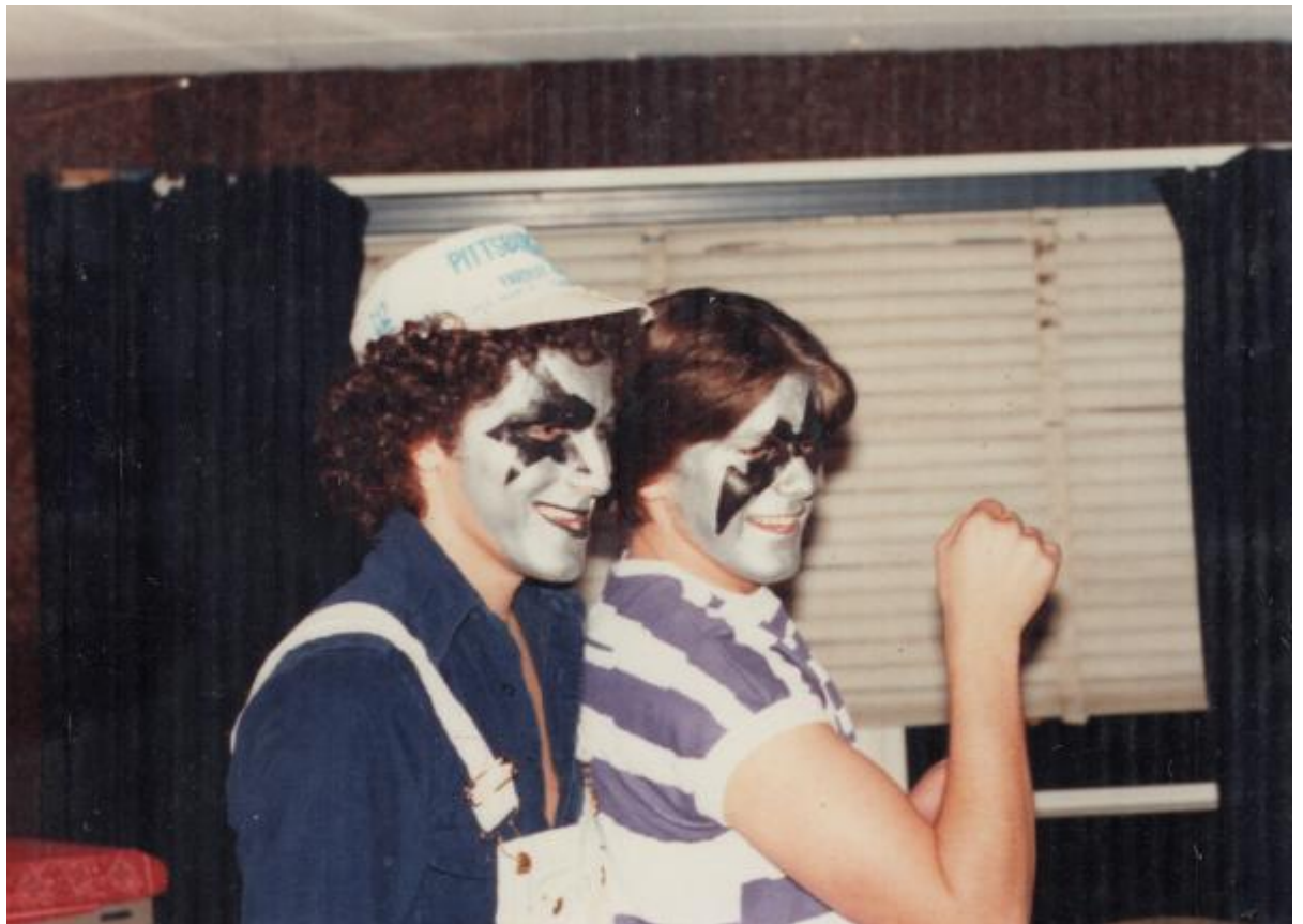
Who looks better with makeup on their faces?