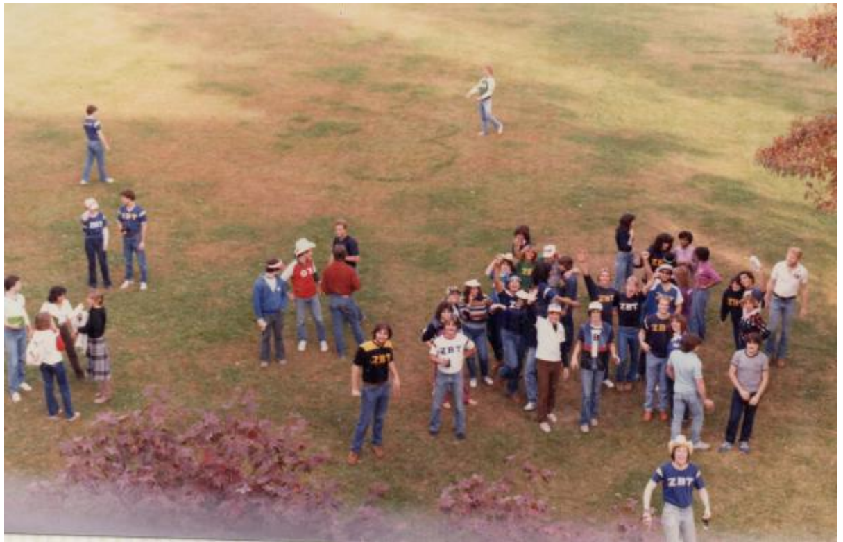
The best parties are the first to arrive and last to leave