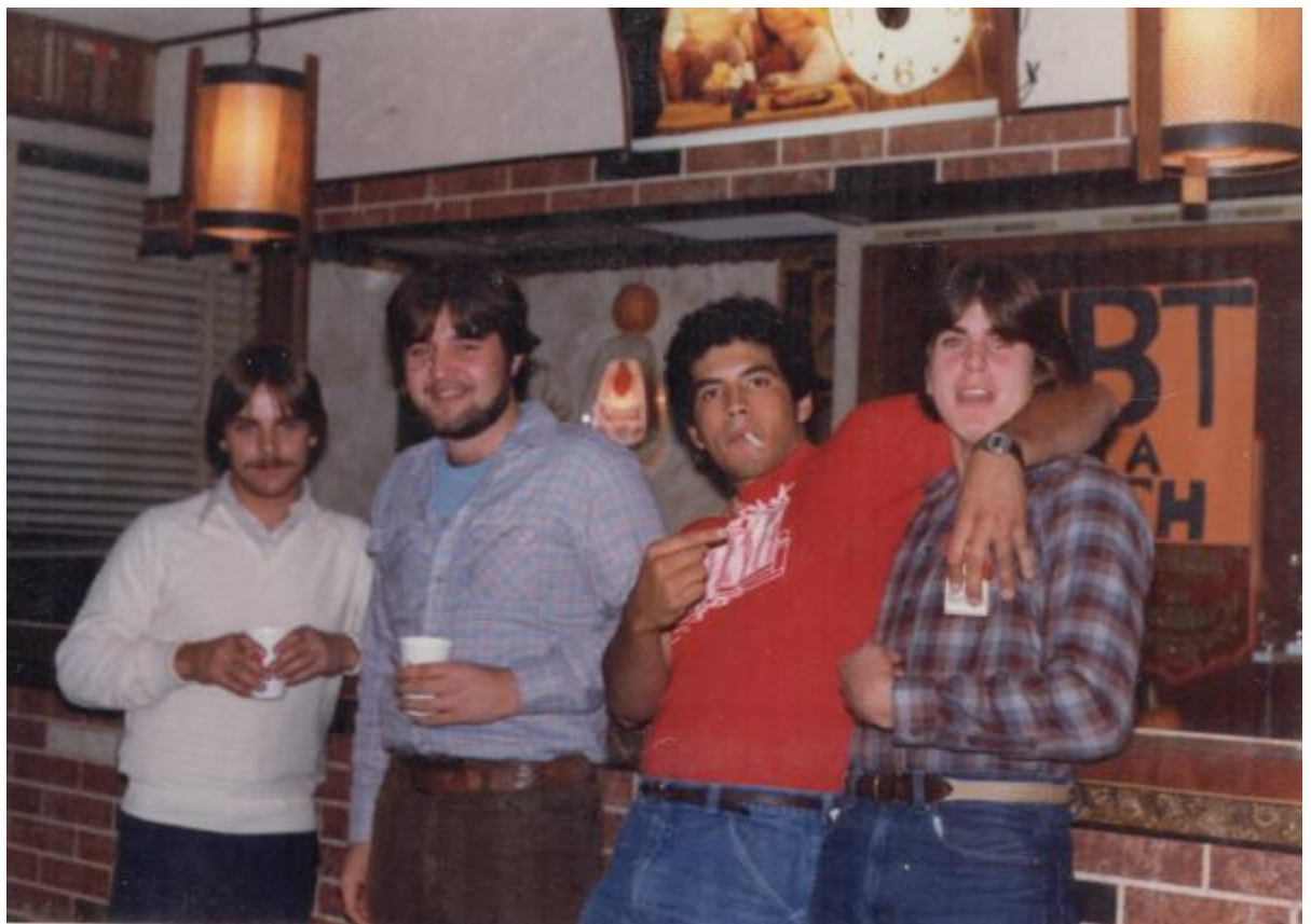
Just questioned these guys "who has the biggest beer gut?"