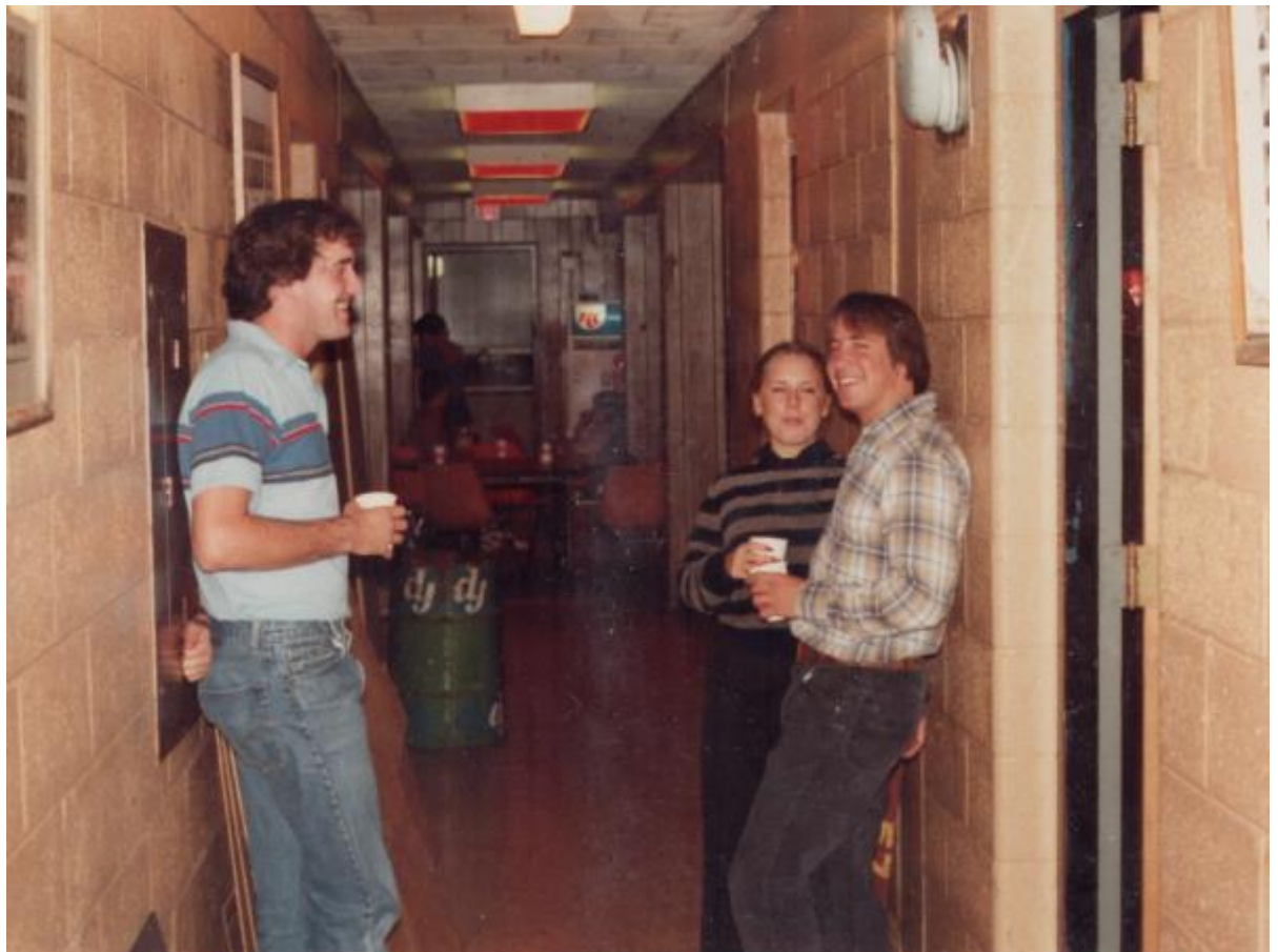
The bottom floor doesn't look bad in pictures