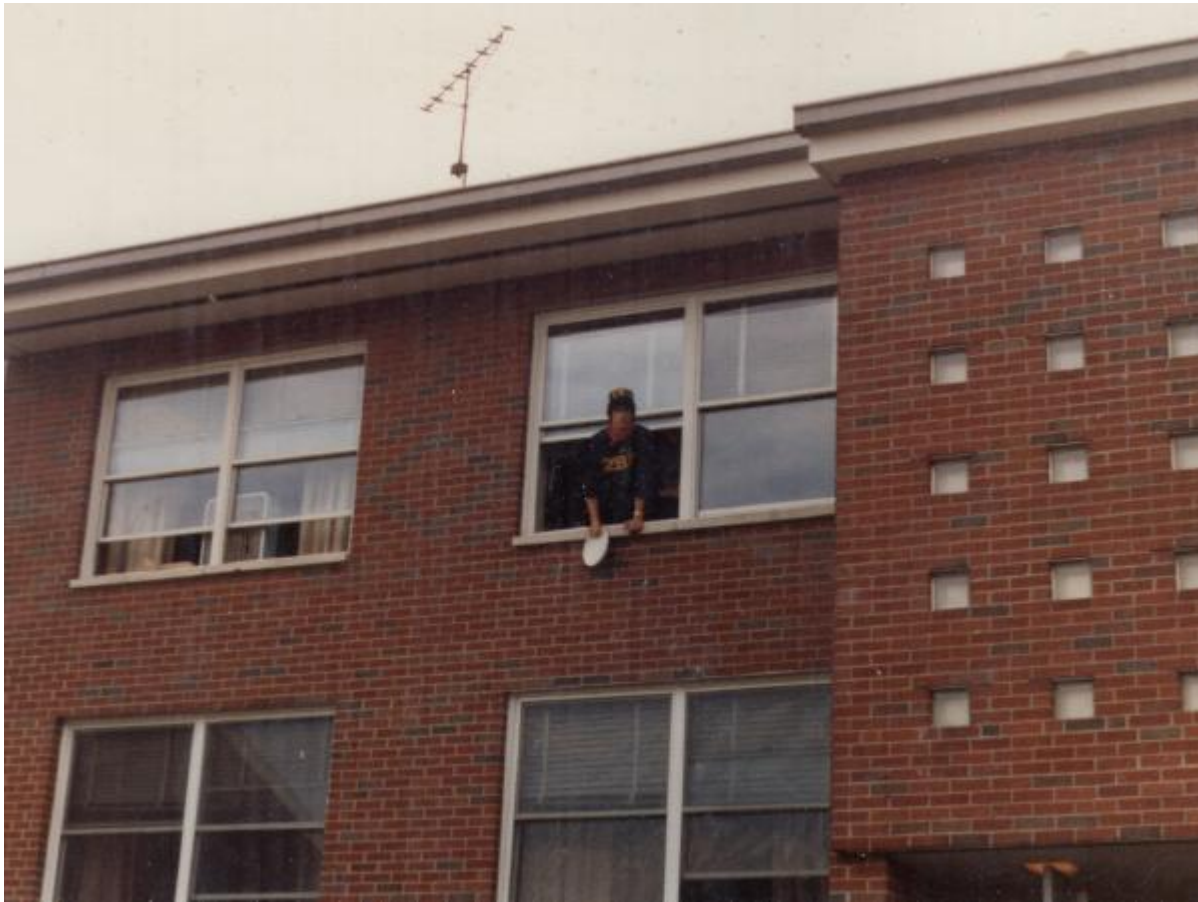
Buck gets a view of what's going on