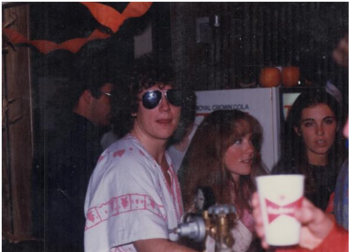
Original costume there Rizzo