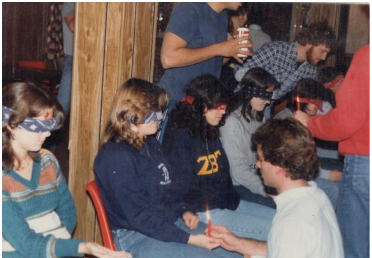
Have you ever seen woman so cooperative?