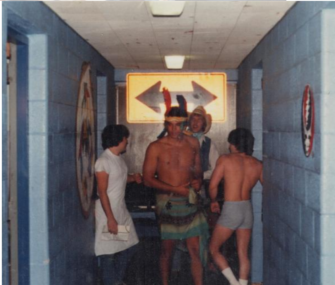
The sign has these guys confused – which room is the party in?