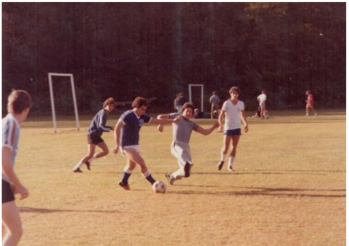
Can't tell if TV is going for the ball or a take down