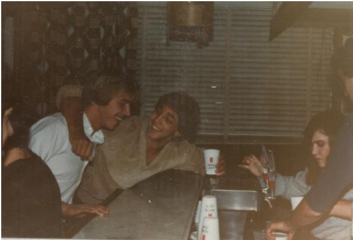
These two are happy to find there's still beer