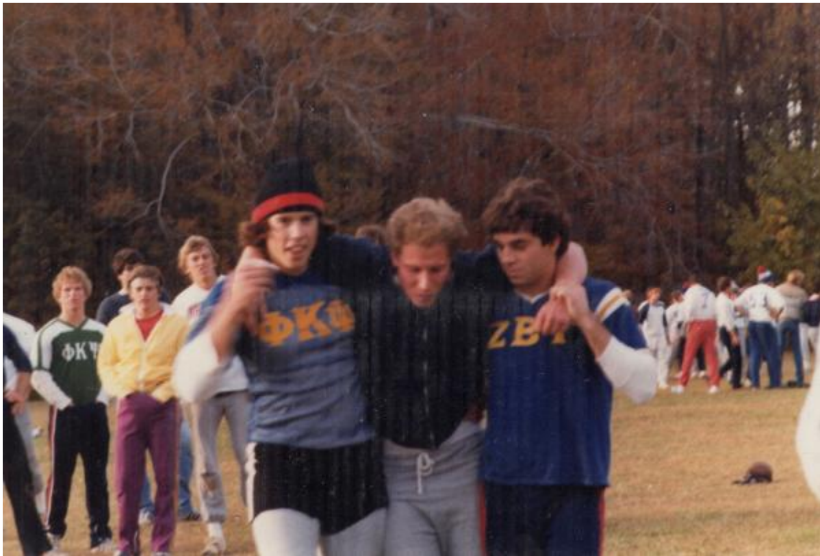
Inter-fraternity assistance for the wounded pledge