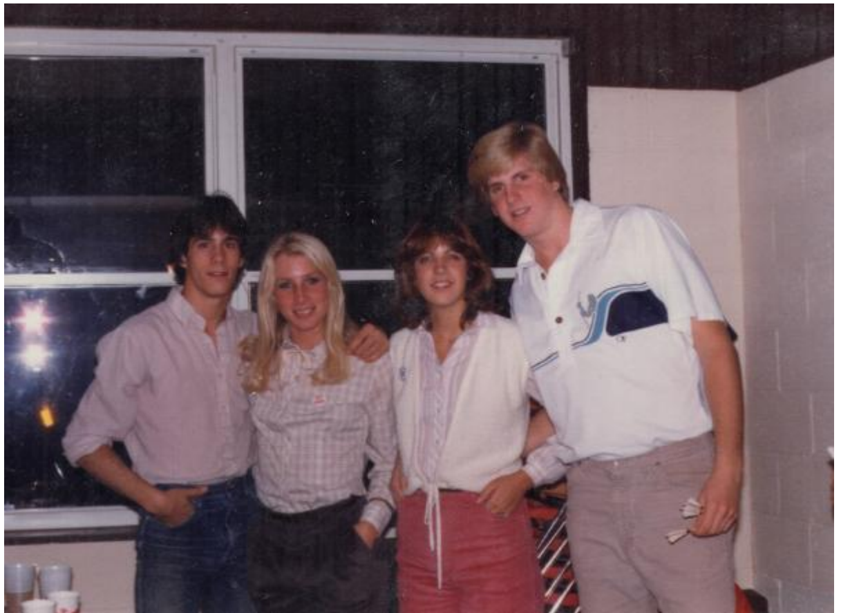
This group checks out how deep their pockets are