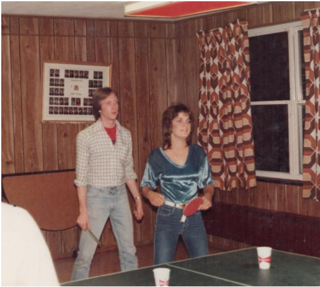
A real competitor – with two good legs