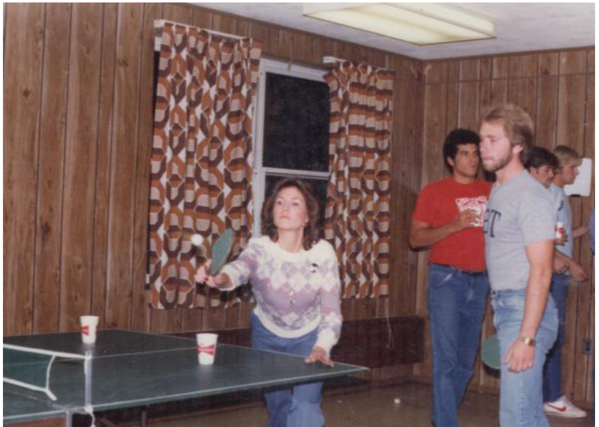
Big discussion in the back – about who's still in the torny and who's out and _orny