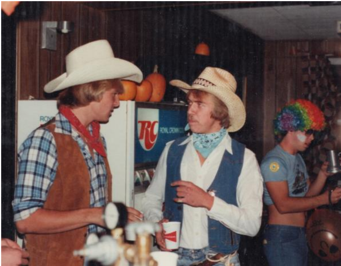
The cowboys discuss their roundup plans for the night