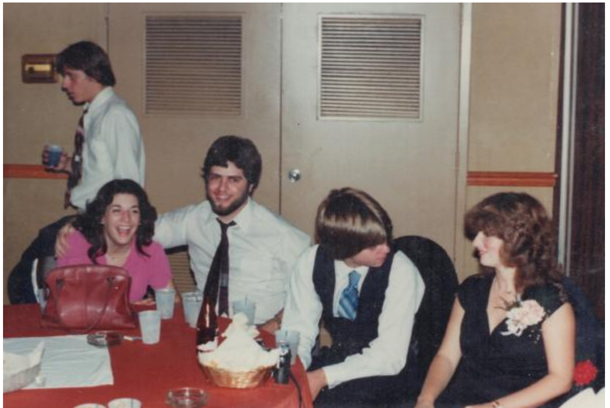
Tom just told his date that he only weighs 120lbs