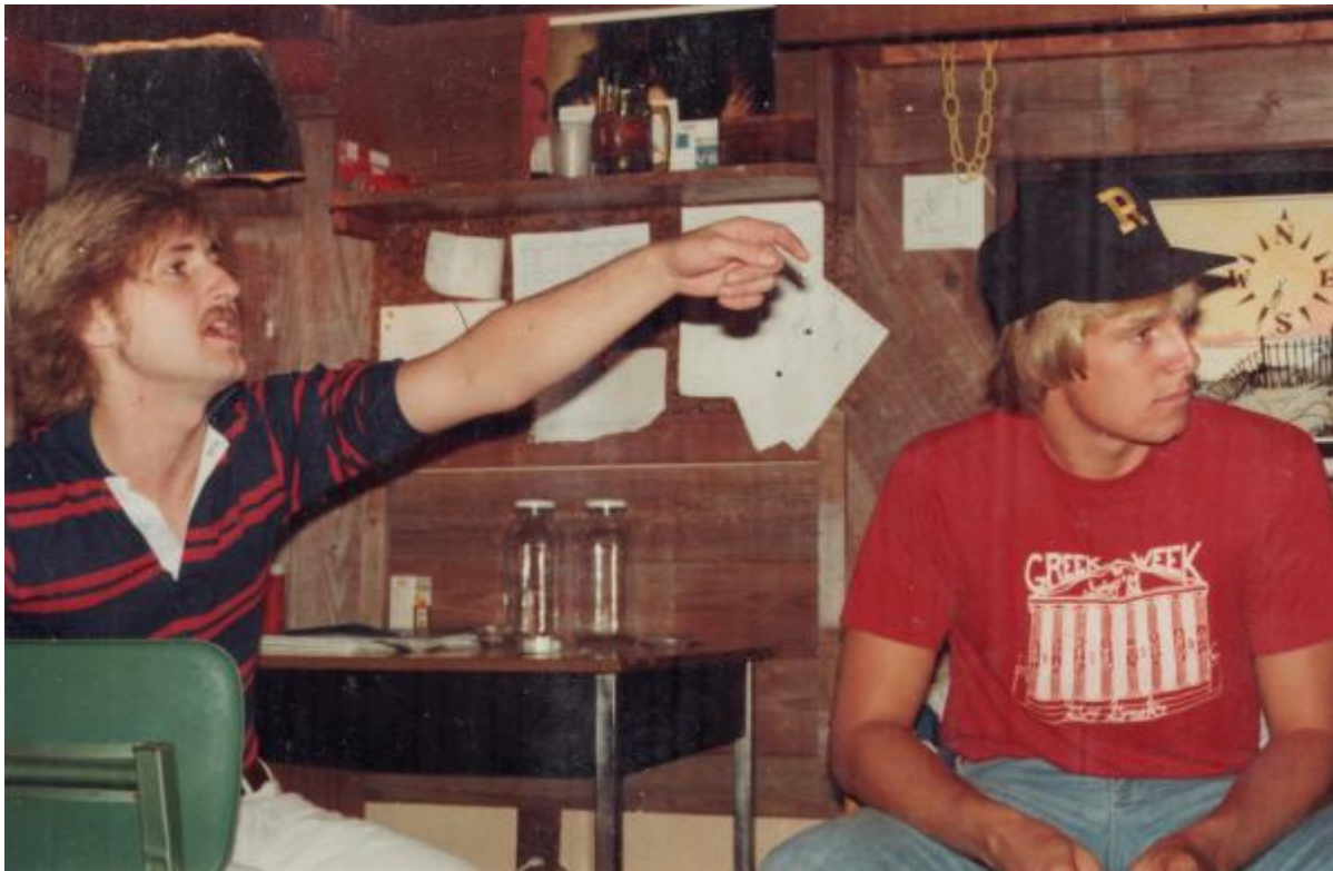
Cobb or cutton and Bob or button doing nutton or sutton