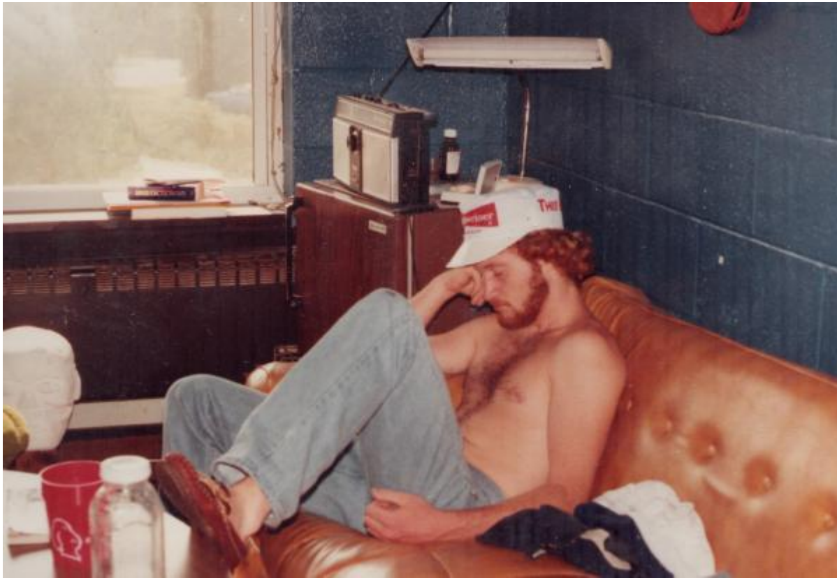
Rickster parting up a storm