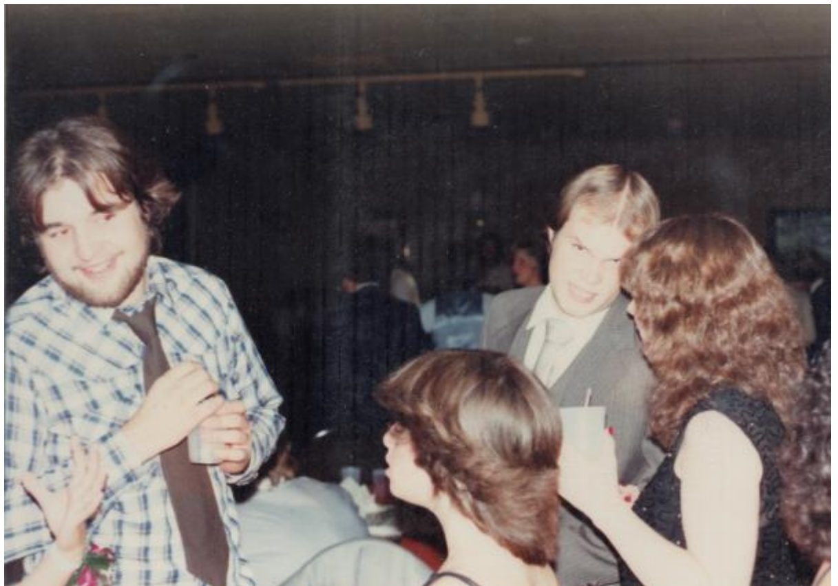
Danny uses his werewolf glaze to hypnotize the woman