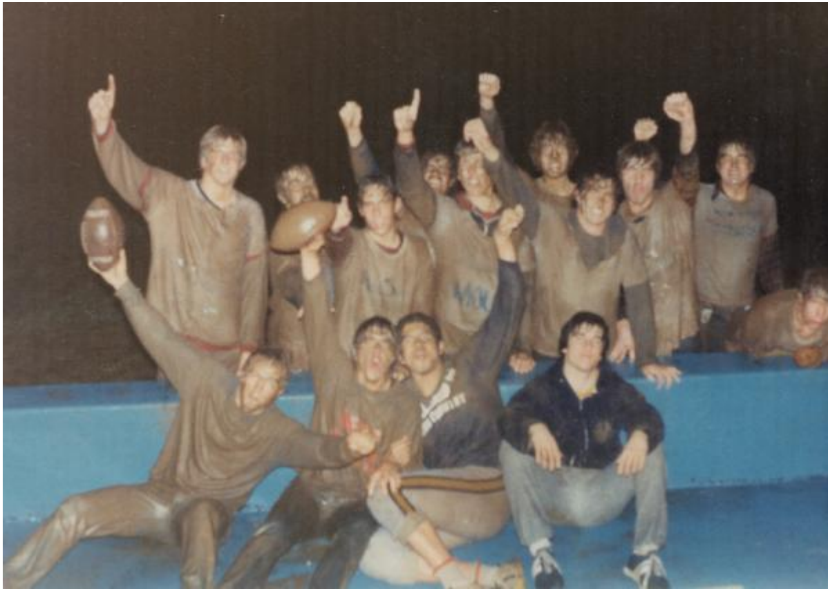
The pledges finally enjoyed a meeting – mud football against the brothers