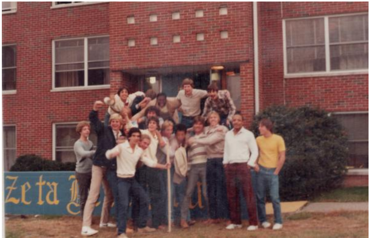
Looking forward to an exciting FUBAR with ZTA