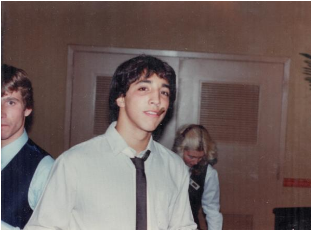
Chach likes to roll 'em big