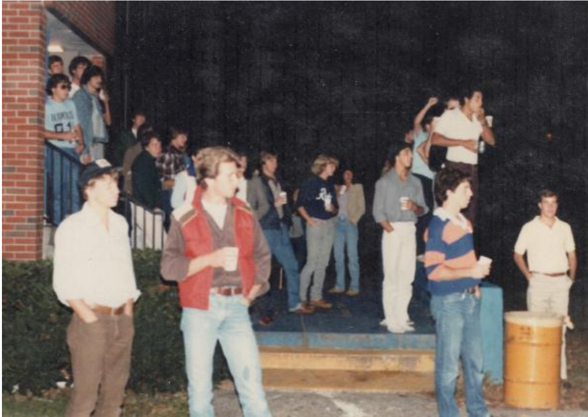
Either Buck becomes sweetheart at ZTA tonight or we wail out "tit" song at the girls