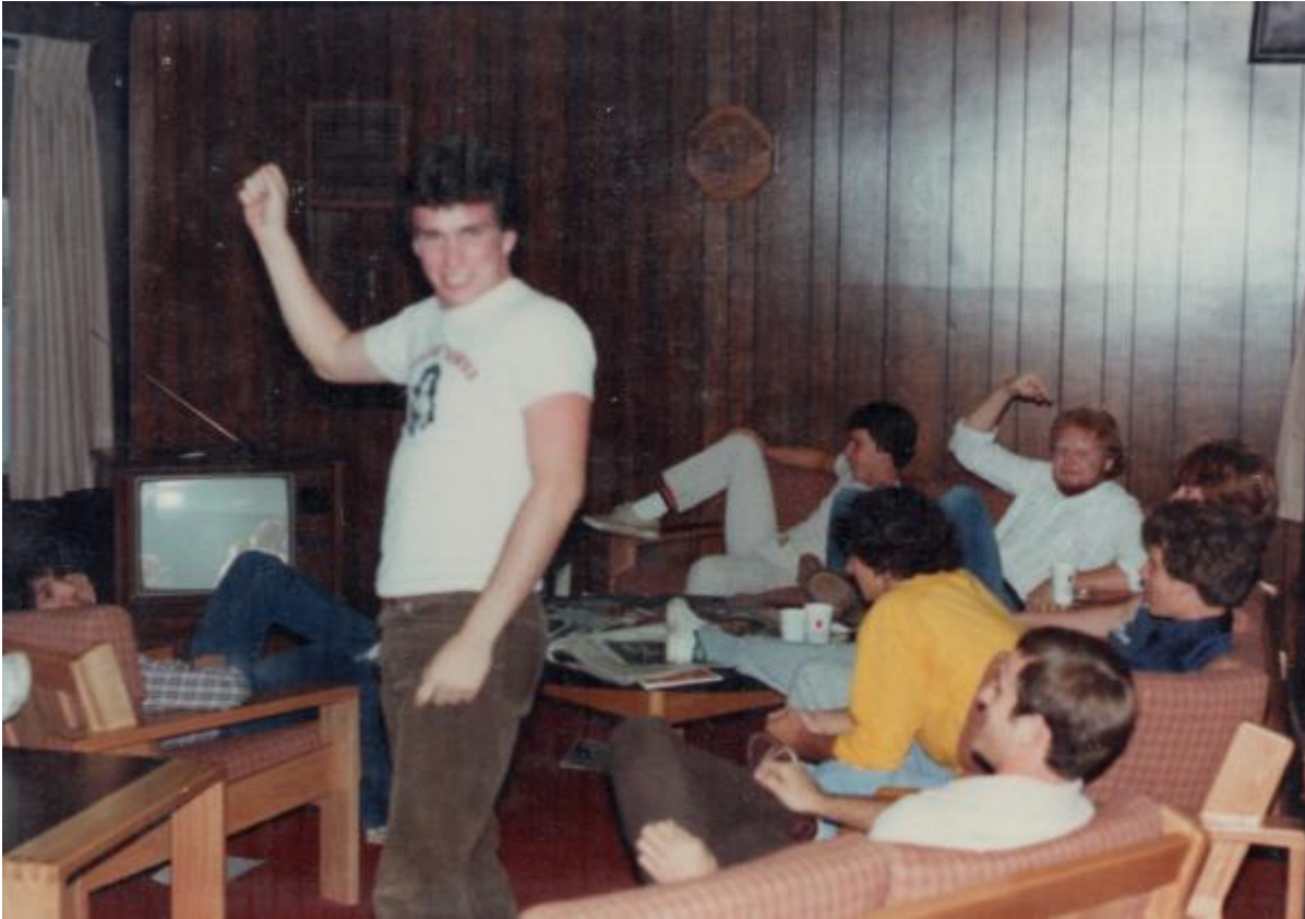
The Eagles must have scored again