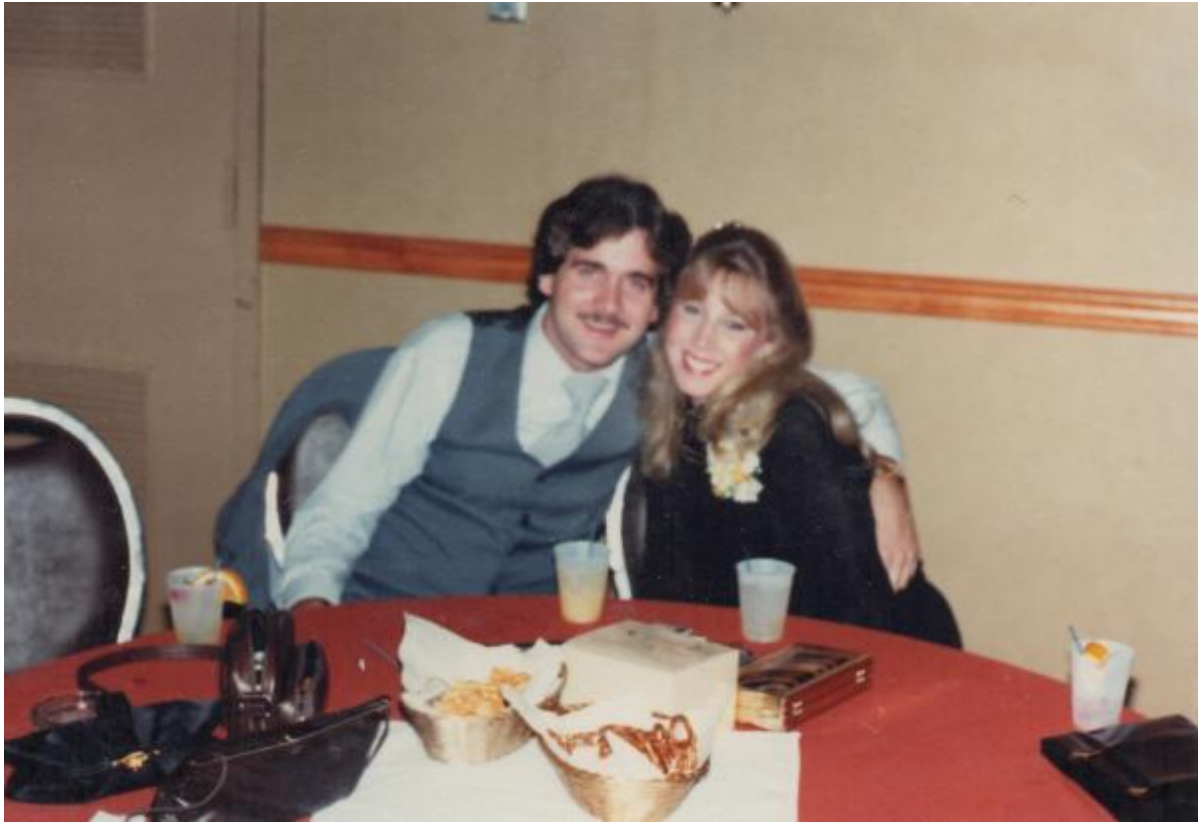
Another handsome couple