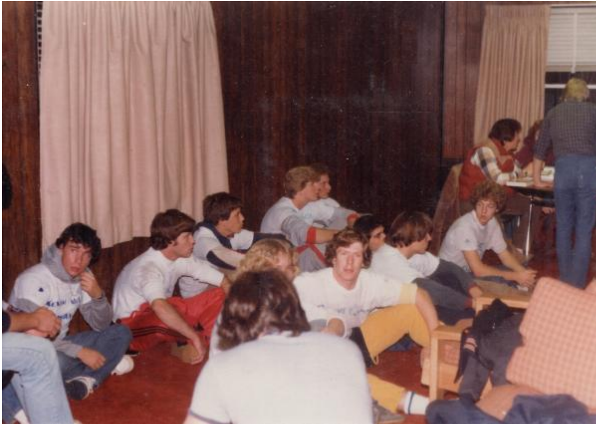
Pledges don't know what's going on