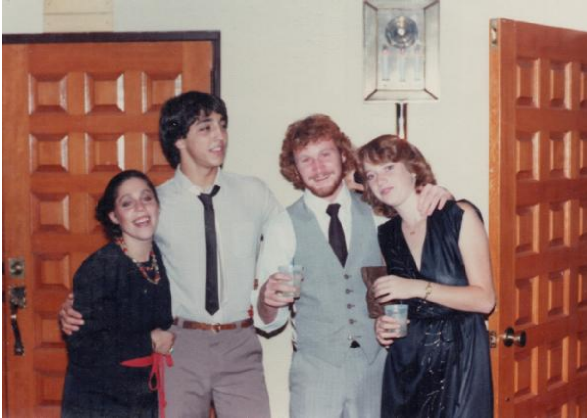
Who's holding up whom?