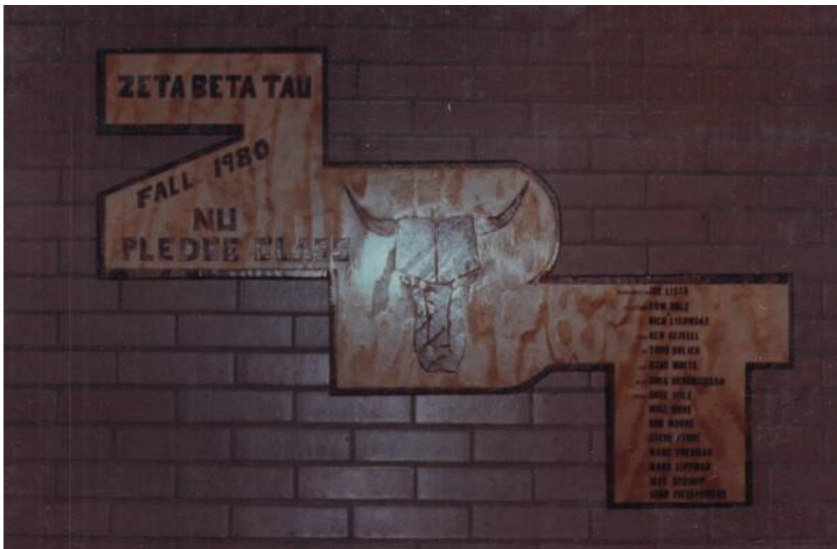
The best pledge class