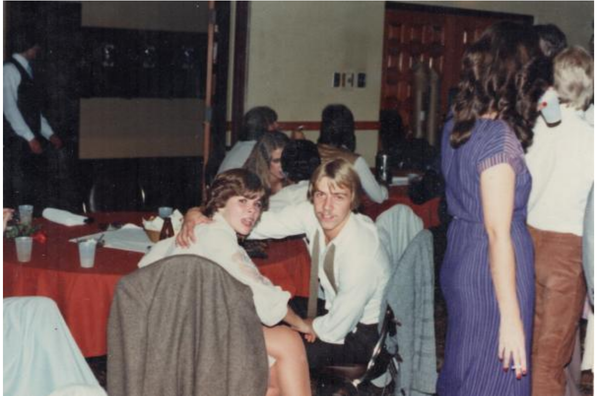
Who got a picture of Theme's best side?