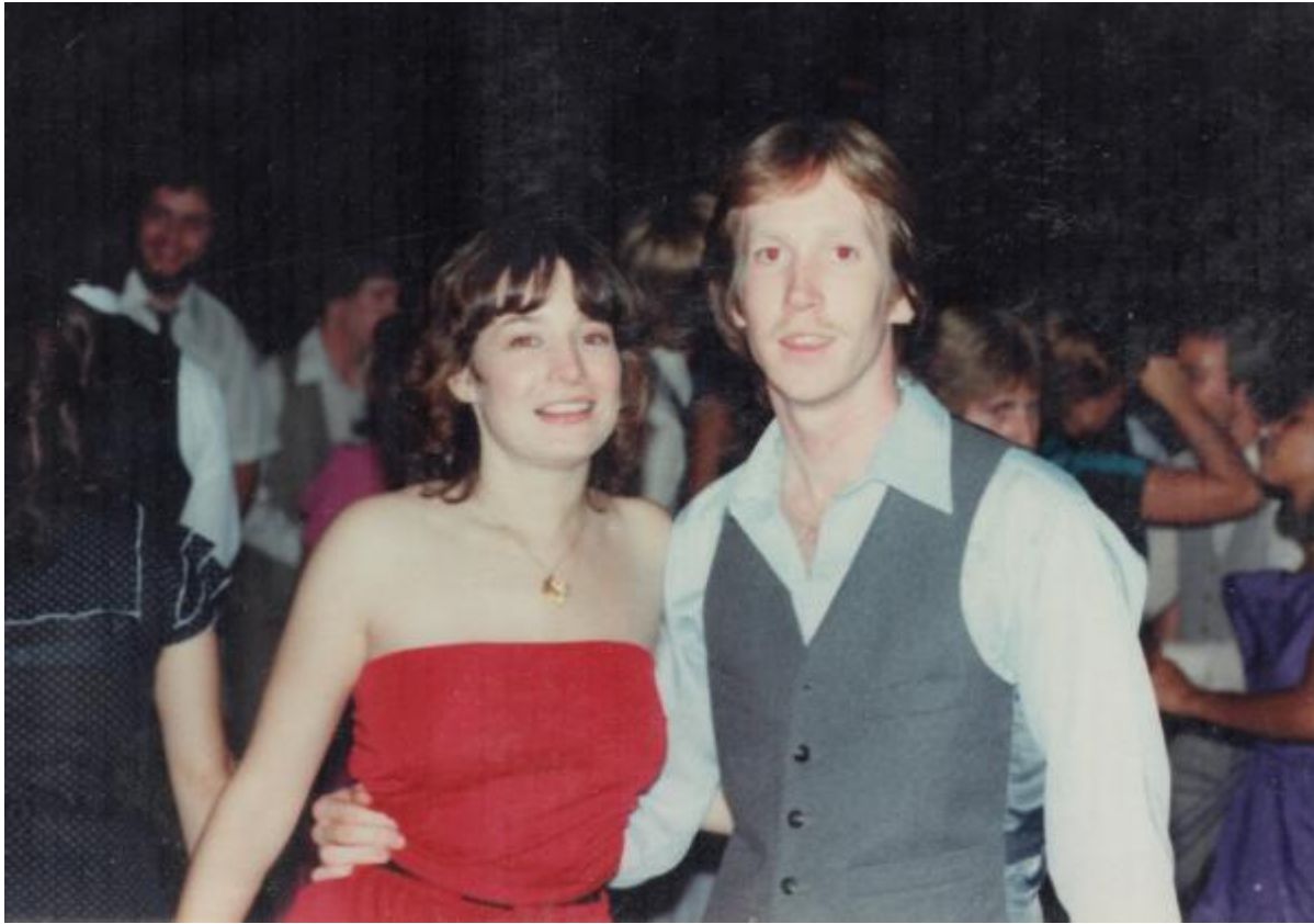
One of our most charming couples