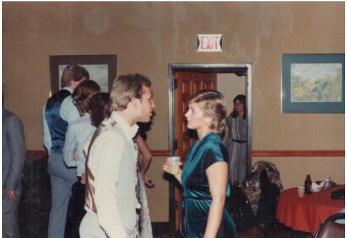
Pods telling the wife a thing or two