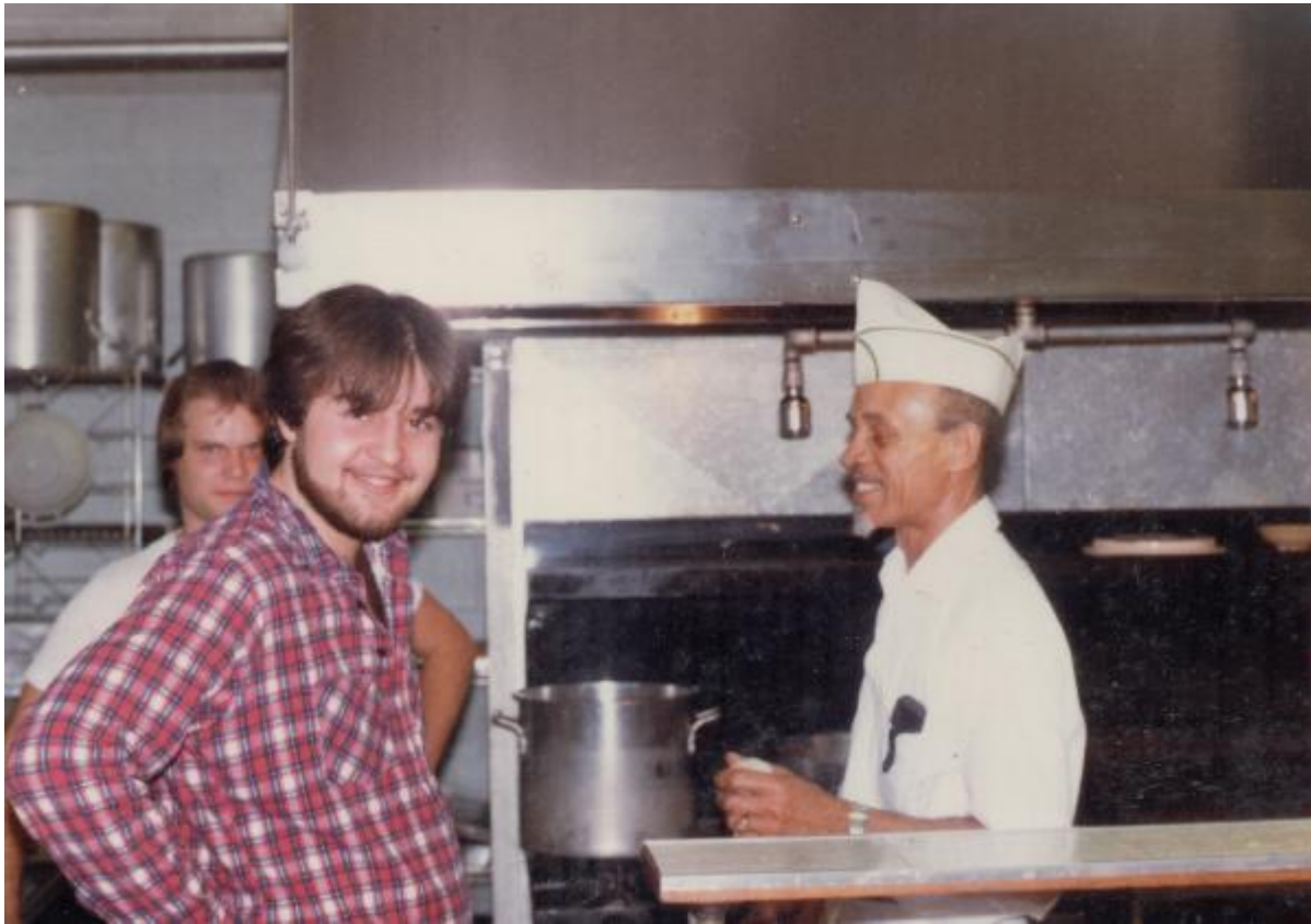
Danny and Burg argue whether to have grilled cheese or hot dogs on Mondays