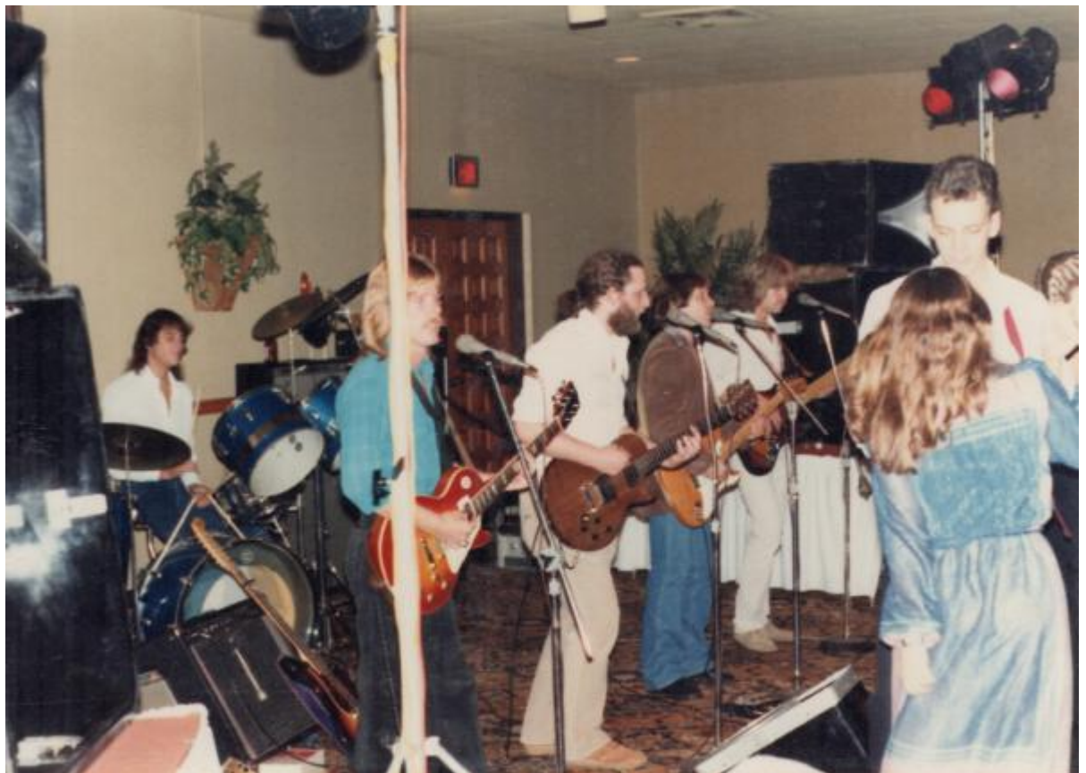
The Band "Traveler" keeps the place hopping