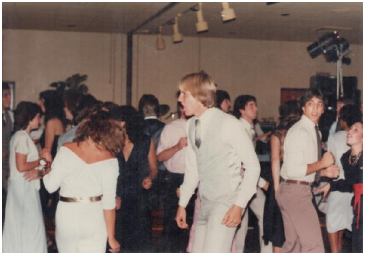
Chachi's checking out Bob's dance moves