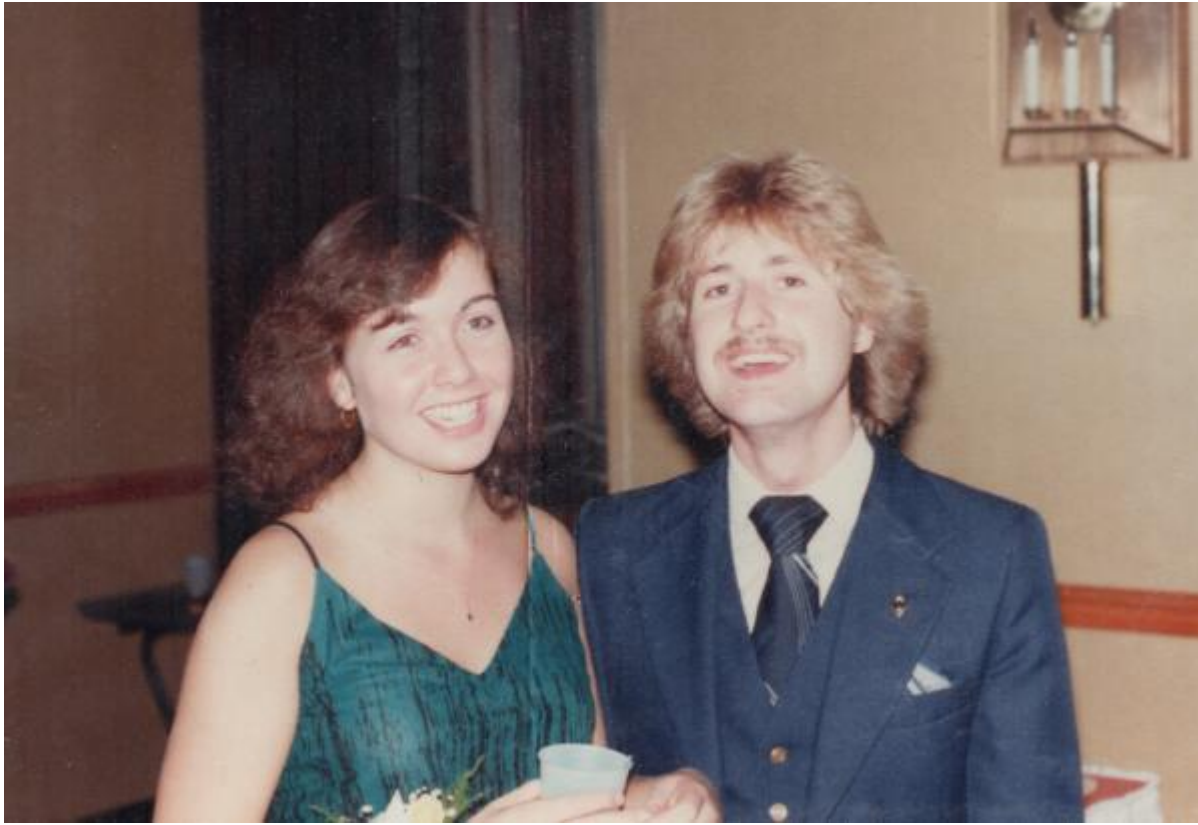
Charlie making his move on whose date?