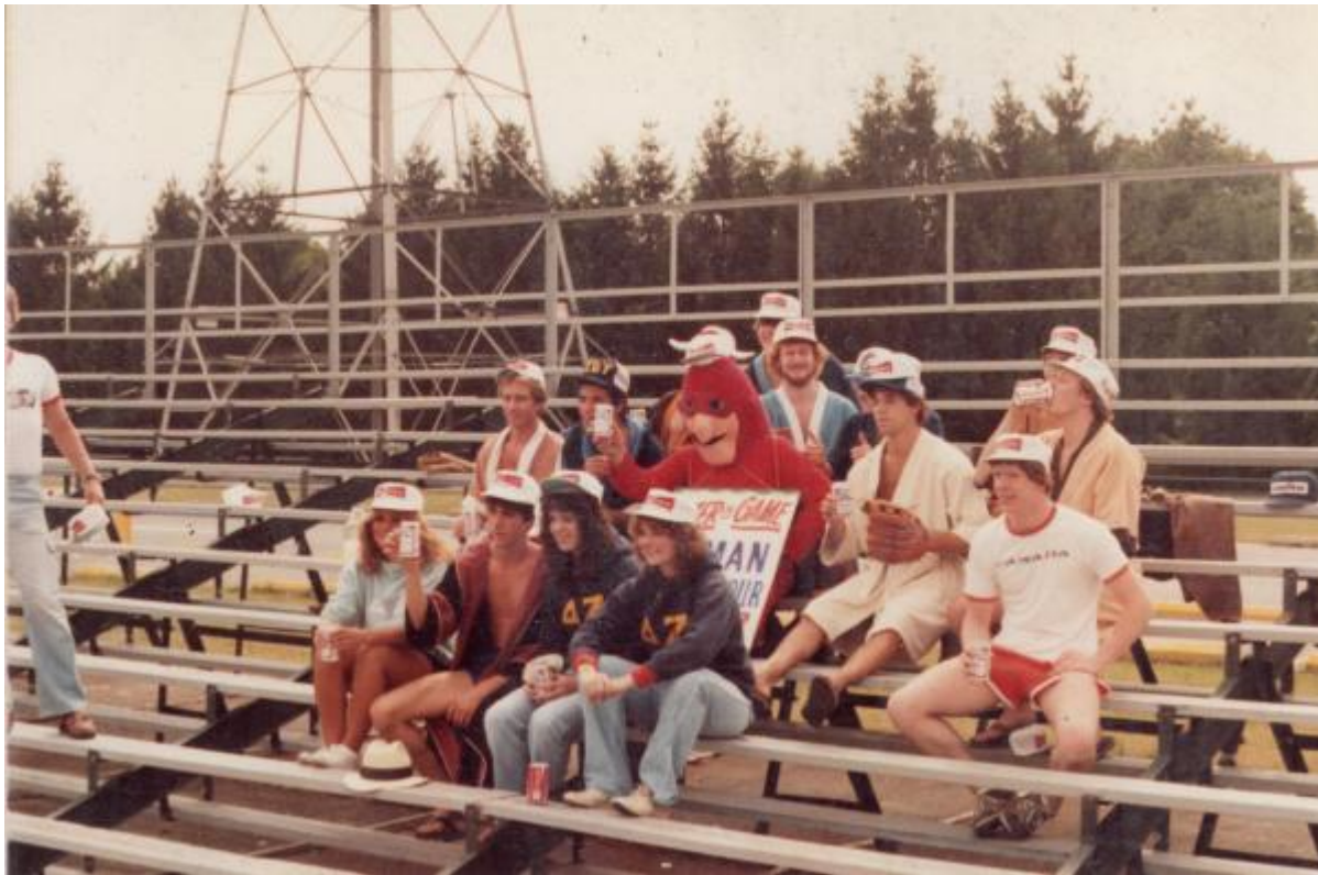
This bud's for us