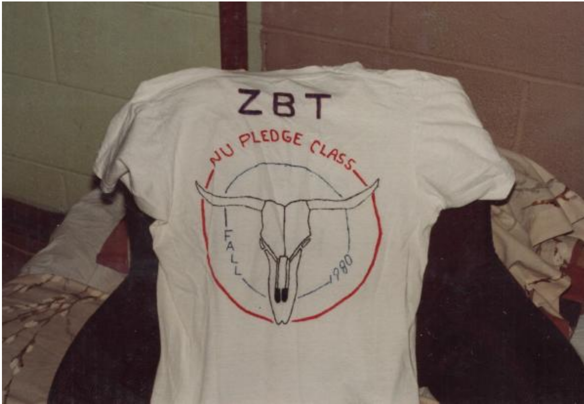
T-shirts to boot