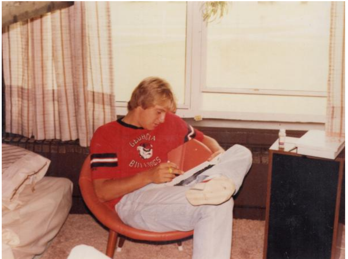
Wait, who's taking a break from partying to do some studying?