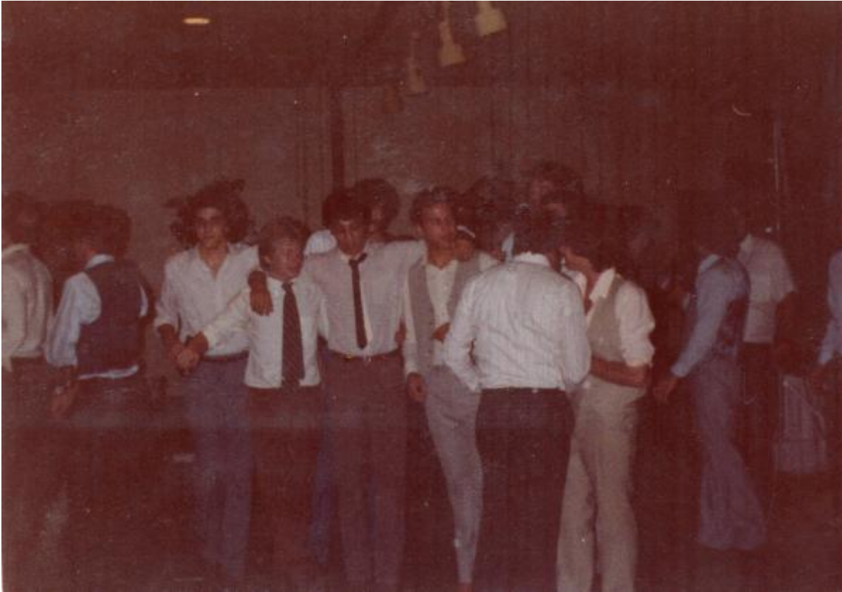
Theme, Chach and Pods prepare to shows us some dance moves