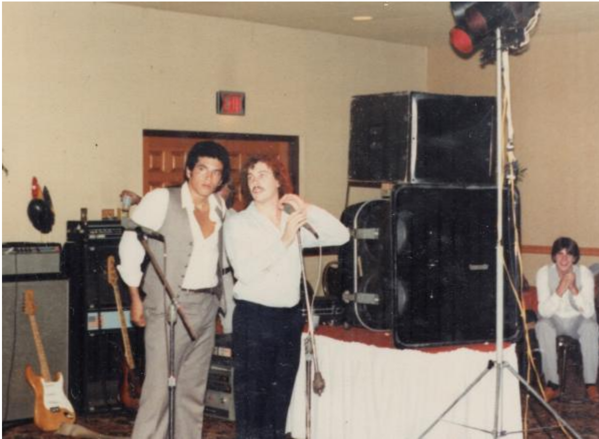
President and VP trying to calm the crowd down