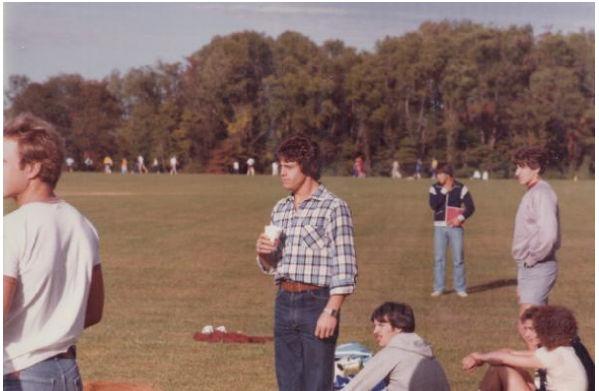
TV wishing he could still come out and kick some ass in football