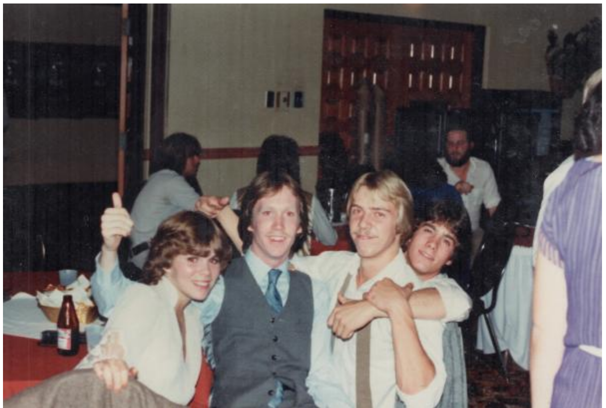
Wait – who's with whom?