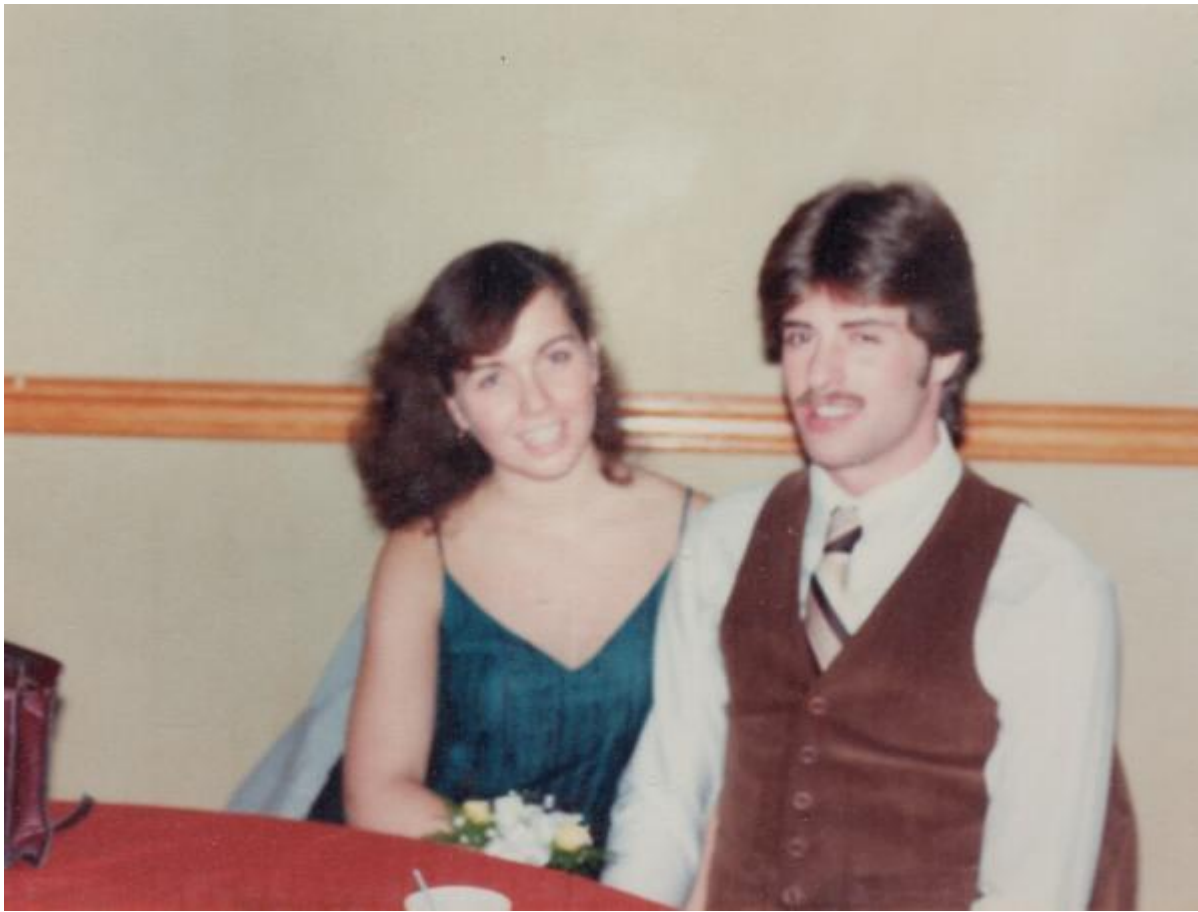
The best looking couple